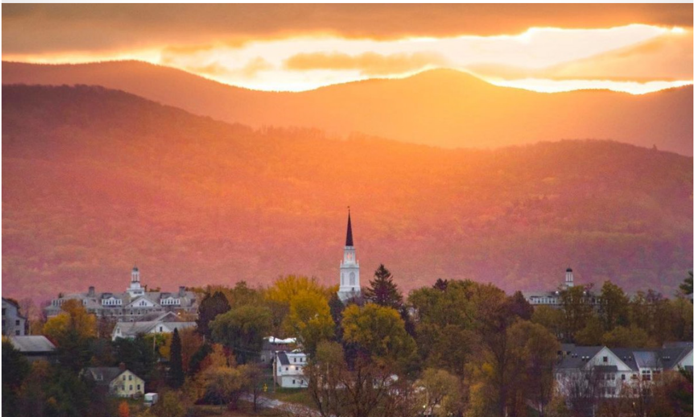
MIDDLEBURY COLLEGE

The Agency provides access to tax-exempt and taxable financing as a conduit issuer of bonds.