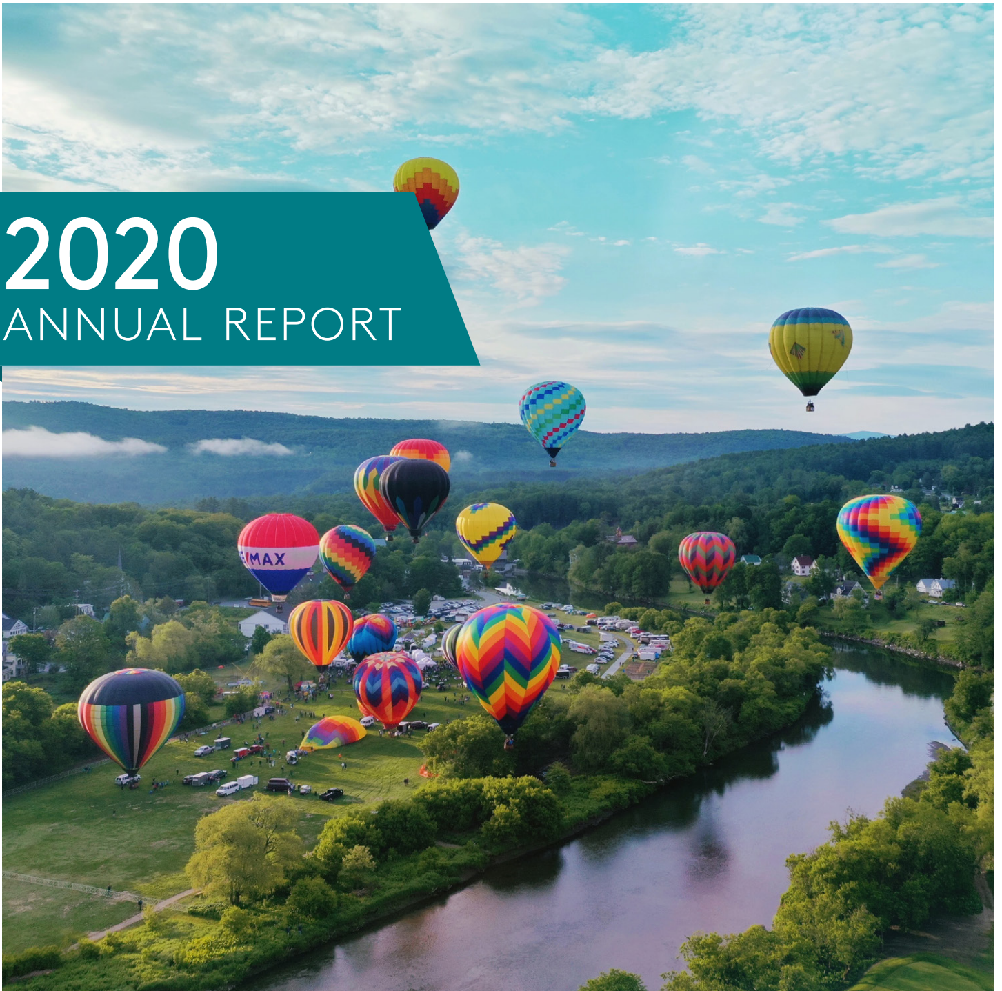
BALLOON FESTIVAL // QUECHEE & HARTFORD, VT