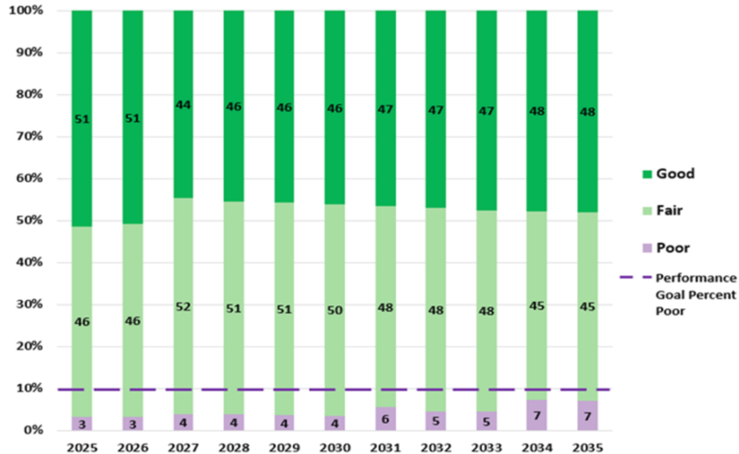
Forecasted State Bridge Condition Distribution with Current Investment Levels