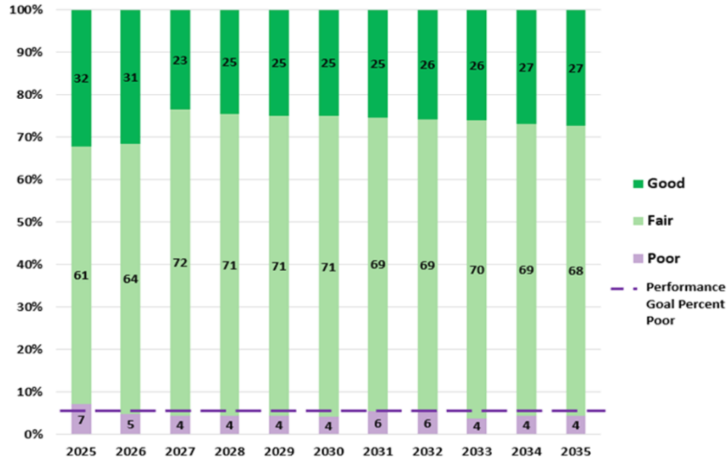
Forecasted Interstate Bridge Condition Distribution with Current Investment Levels