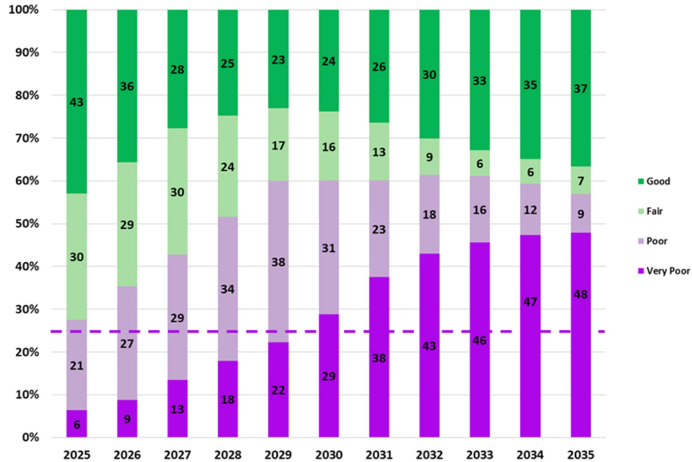
Forecasted Pavement Condition Distribution with an Annual Investment of $103 Million