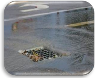
Photo: Road stormwater collection