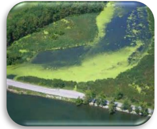
Photo: Algal Bloom