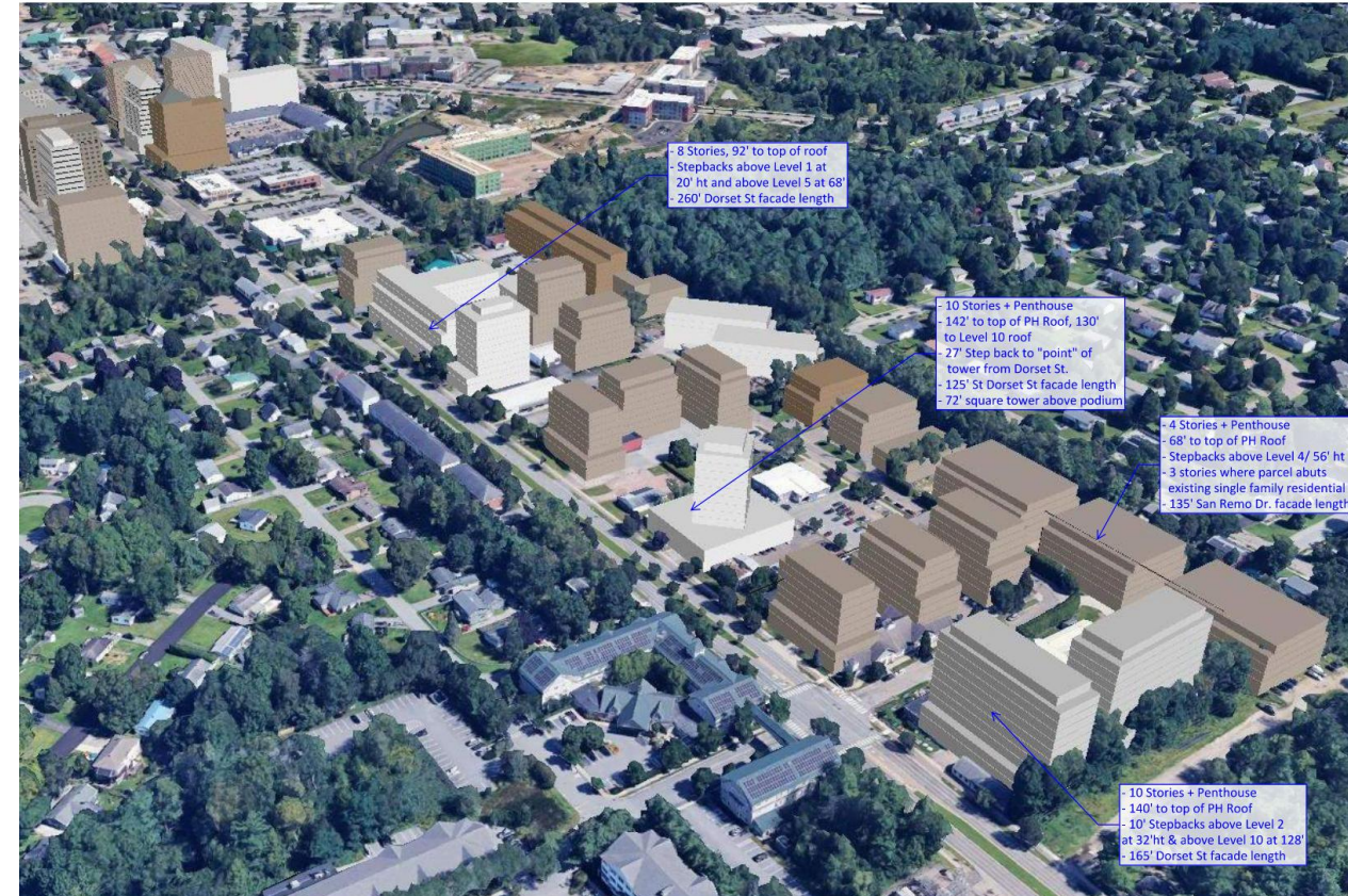
Proposed Form District Changes: Massing Examples April 7, 2025

This study illustrates near maximum potential heights under zoning rule changes being considered by the South Burlington Planning Commission and is intended solely to inform the rule-making process. None of the massing examples represent actual proposed development or full compliance with all aspects of form based code such as fenestration or facade articulation.