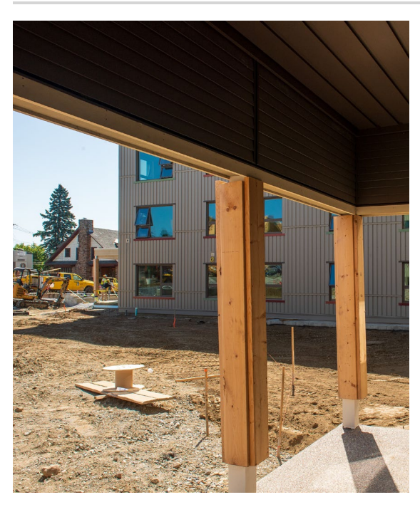
Laurentide Apartments, Burlington, VT