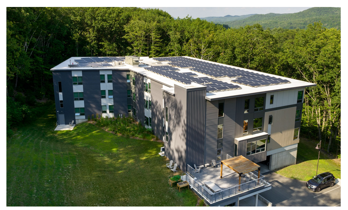
Rooftop Solar at Wentworth Apartments, Hartford, VT