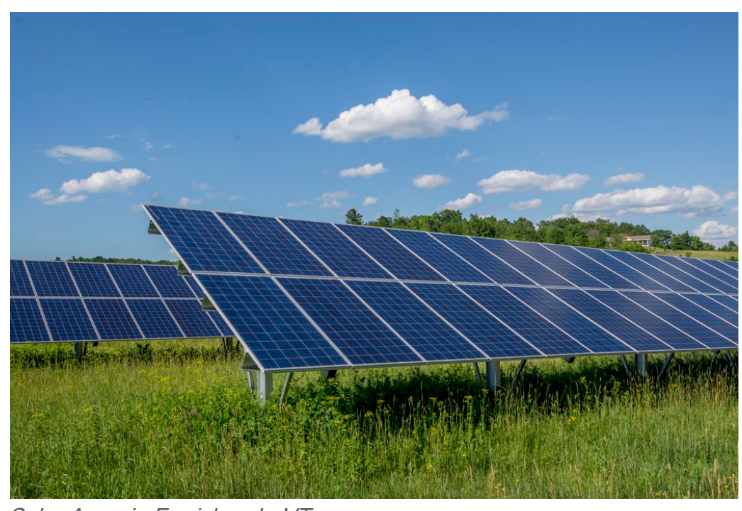
Solar Array in Ferrisburgh, VT