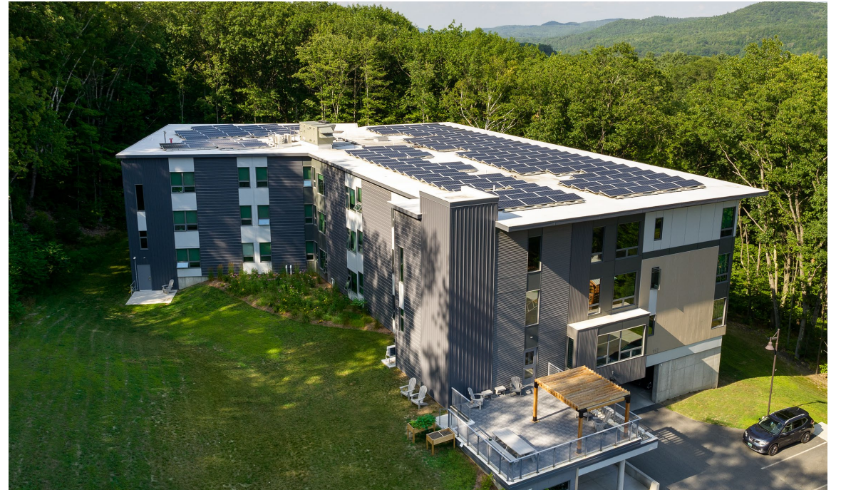
Rooftop Solar at Wentworth Apartments, Hartford, VT