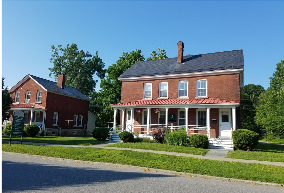
Ethan-Allen Duplex, Essex, VT

in a way that delivers higher incentives for housing for the lowest income Vermonters.