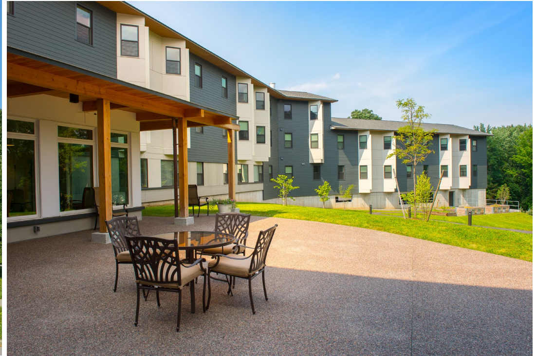
Red Clover Commons, West Brattleboro, VT