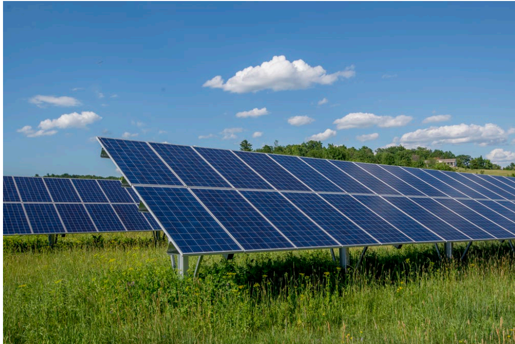
Solar Array in Ferrisburgh, VT