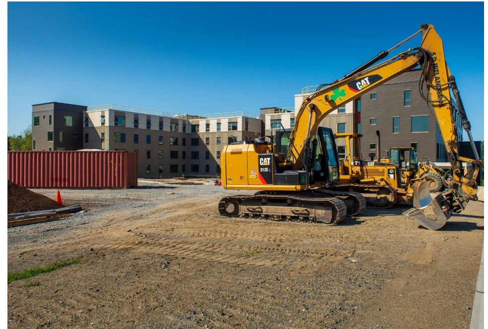
Laurentide Apartments, Burlington, VT