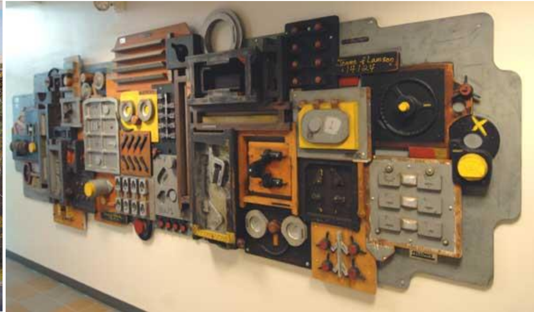
State Office Building, Springfield Work Patterns Collage of wooden tool molds and patterns Artist: Jim Florschutz 1998