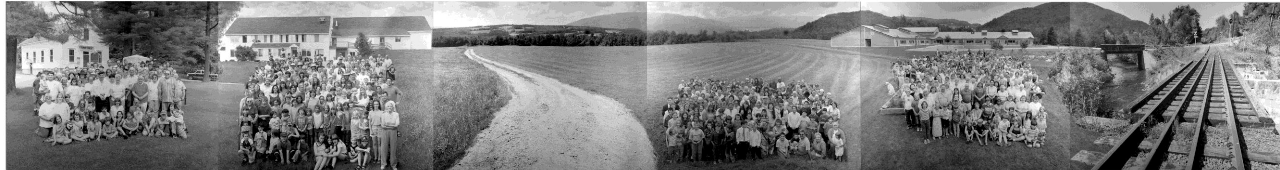
Caledonia Courthouse, St. Johnsbury: When Paths Cross , Digitized Photo Collage Artist: Michael Sacca 2001