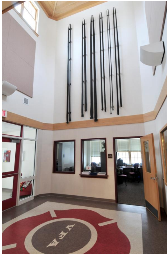
Vt Fire Academy, Pittsford Tools of Command Anodized aluminum wall sculptures Artist: Gregory Gomez 2012