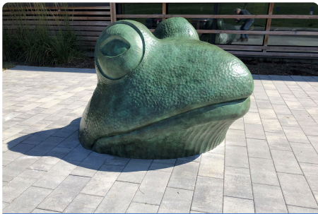
Agricultural & Environmental Lab, Randolph Center

These works build a distinctive sense of place, support cultural tourism, and are a key attribute in making communities healthier and more vibrant.