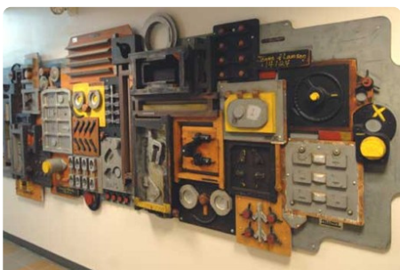
State Office Building Springfield