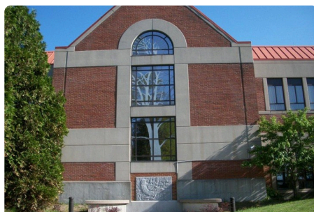
Family & District Courthouse Brattleboro