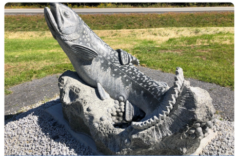
Fish Culture Station Roxbury