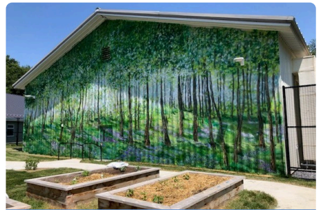
River Valley Therapeutic Residence, Essex