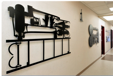
Vermont Fire Academy Pittsford