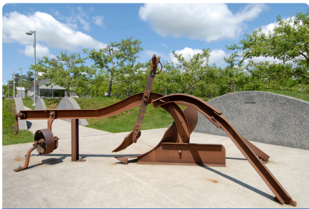
Northbound I89 Rest Area Williston