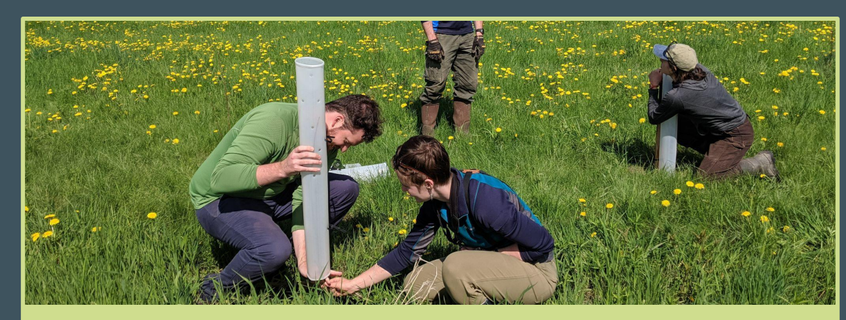
Natural Resources Conservation & Restoration