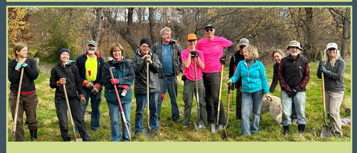
Education & Outreach