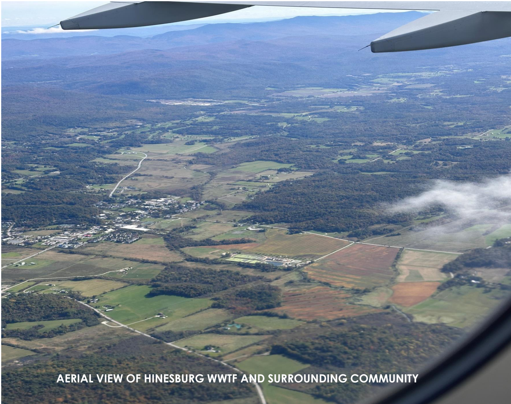
AERIAL VIEW OF HINESBURG WWTF AND SURROUNDING COMMUNITY