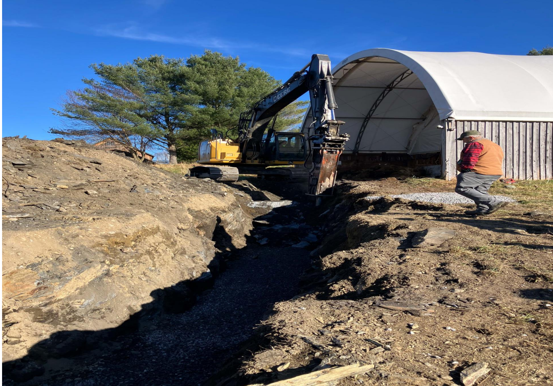
INSTALLATION OF WATER MAIN TO NEW SOURCE TO ADDRESS PFAS CONTAMINATION FOR CRAFTSBURY FD#2 WATER SYSTEM