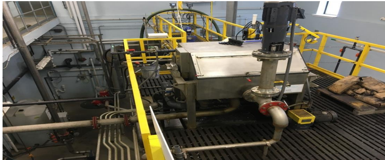
Waterbury WWTF Phosphorus Upgrade: CoMag® process element located within process building.