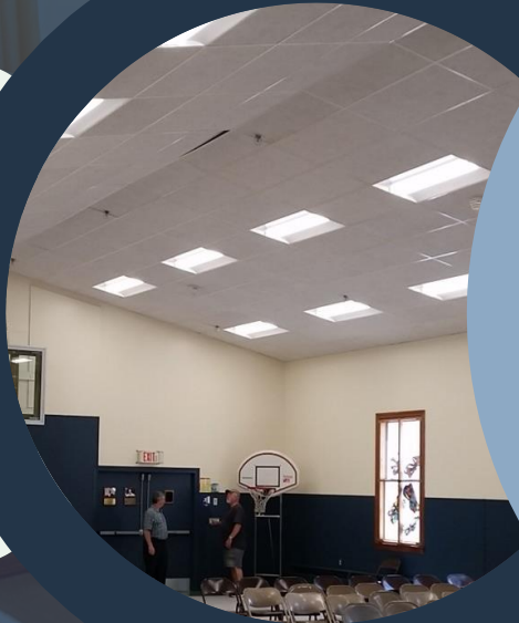
Lighting & Controls