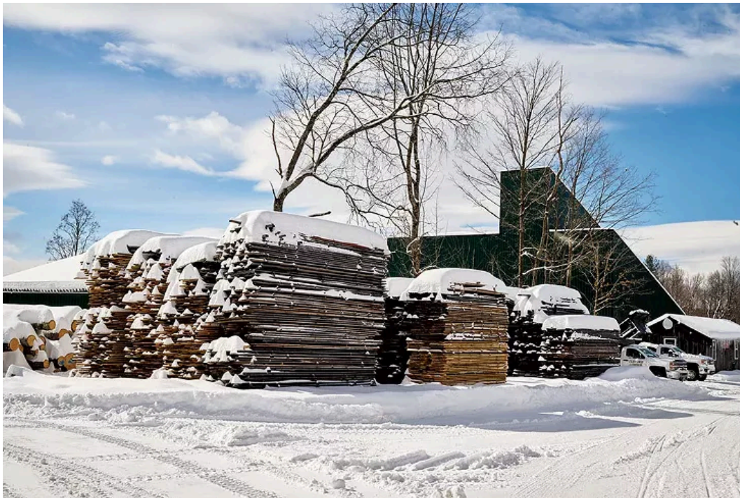
Clifford Lumber in Hinesburg