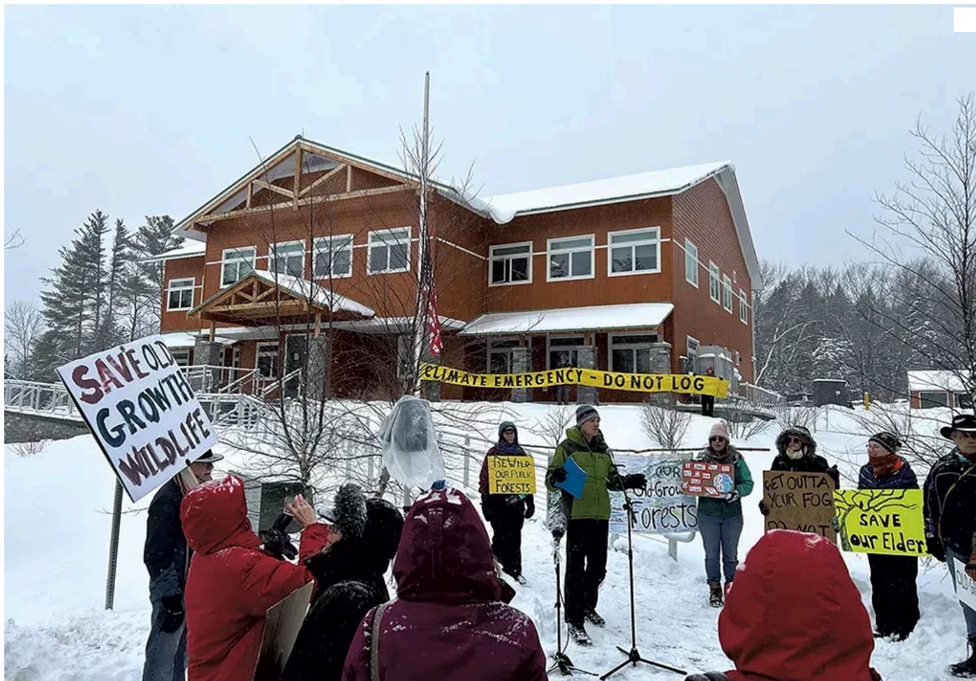
Standing Trees protest