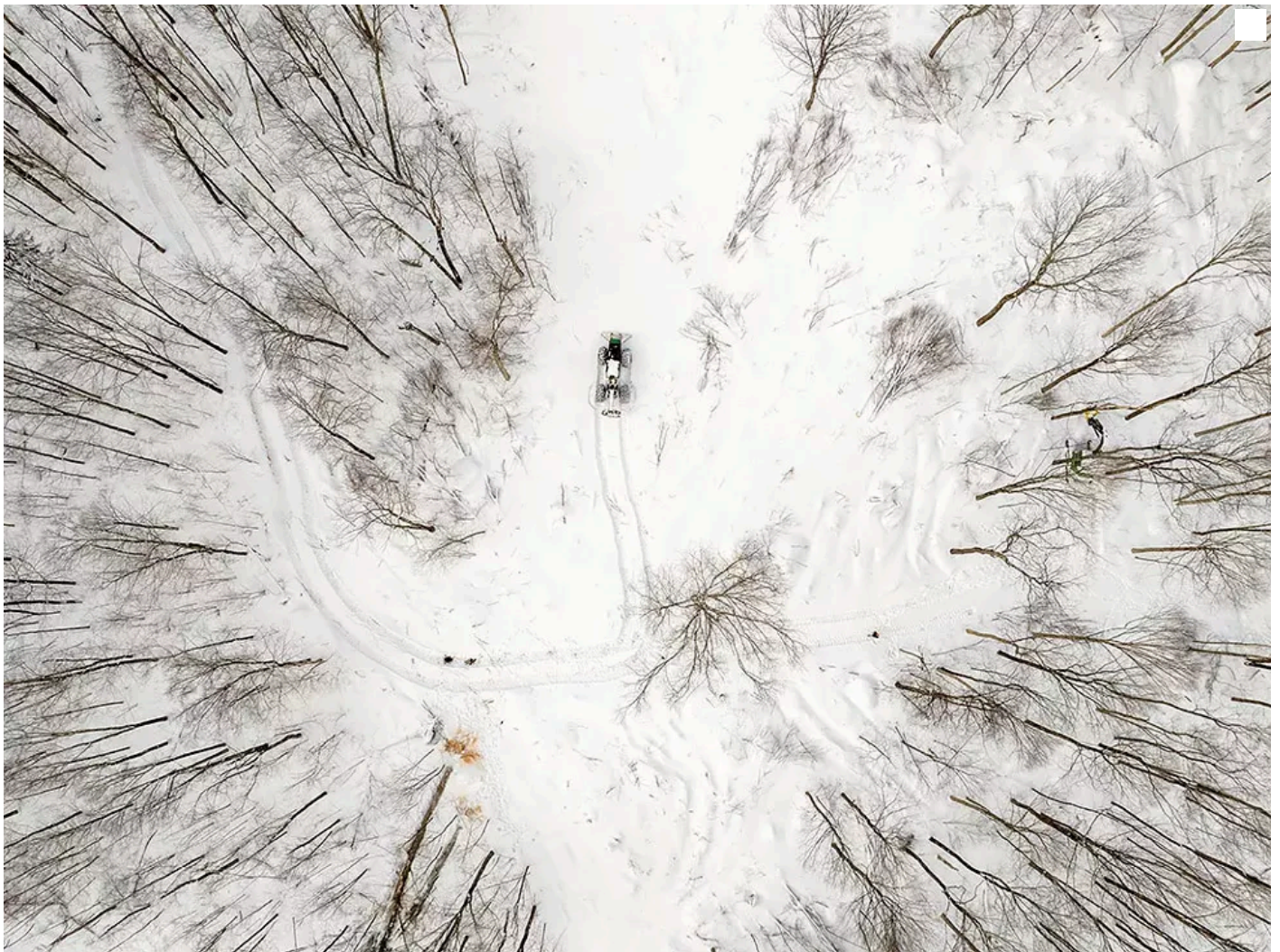
Forestland in Lincoln