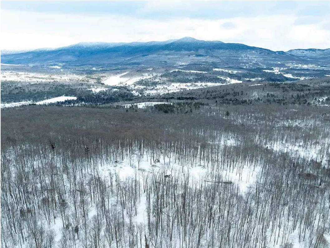
Forestland in Lincoln