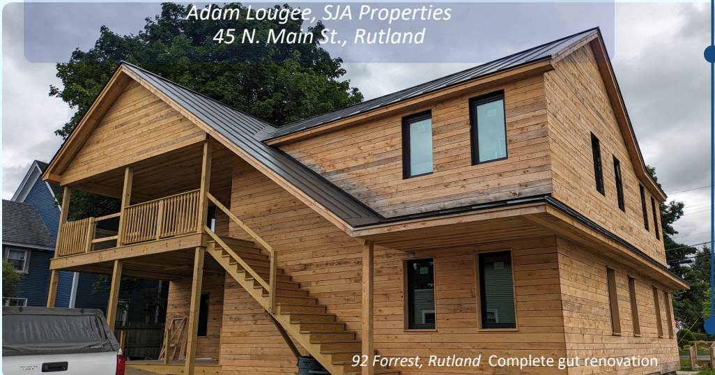
92 Forrest, Rutland Complete gut renovation