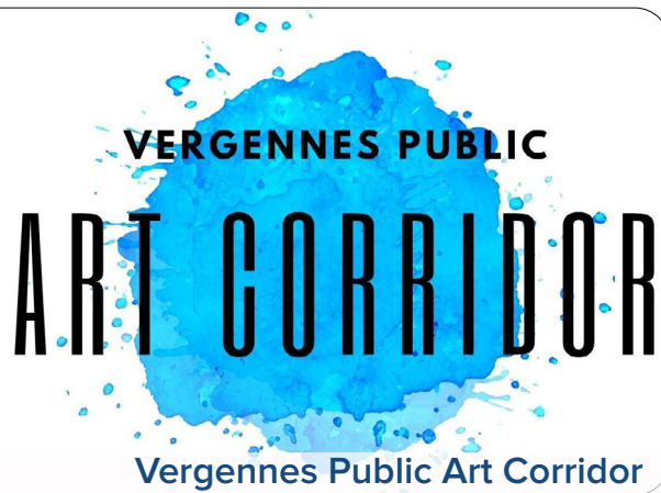
Vergennes Public Art Corridor