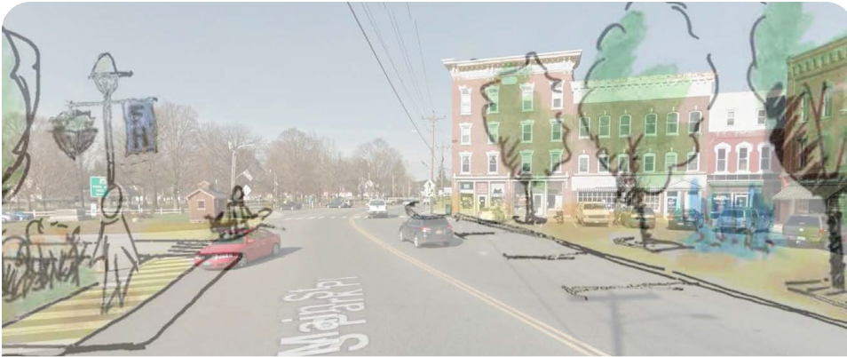
Fair Haven Downtown Streetscape Improvement Plan

Illustrated plans for specific locations galvanize public engagement around concrete changes and communicate with a broad range of people. The resulting visual plans and drawings help the community envision possibilities, align goals, and give the municipality useful leverage for obtaining public facility funding. The following projects, funded by Municipal Planning Grants, used simple illustrations to big effect.