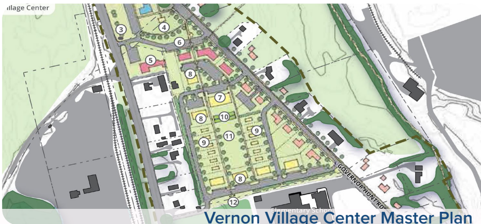
Vernon Village Center Master Plan