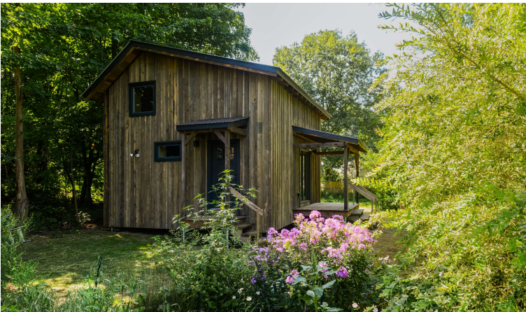
New Frameworks panelized 900 SF ADU with compressed straw bale exterior walls