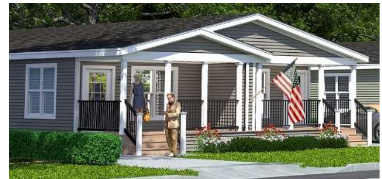
Cavco manufactured housing duplex