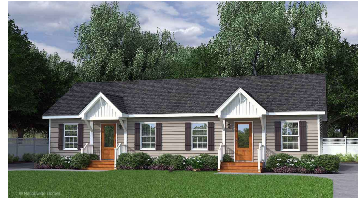
Nationwide Homes modular duplex