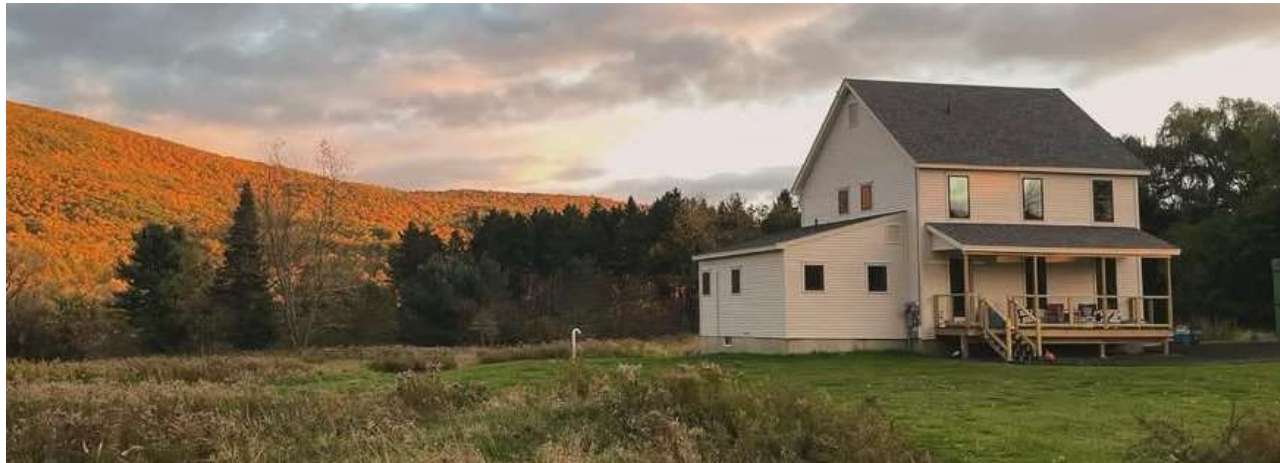
Huntington TruHome volumetric modular home