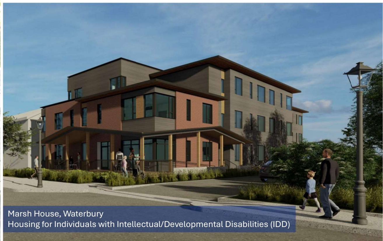
Marsh House, Waterbury Housing for Individuals with Intellectual/Developmental Disabilities (IDD)