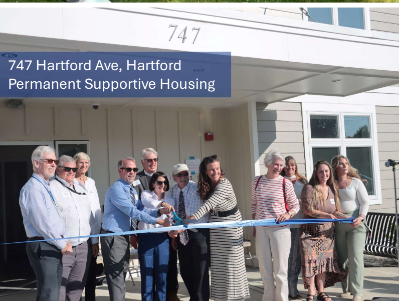
747 Hartford Ave, Hartford Permanent Supportive Housing