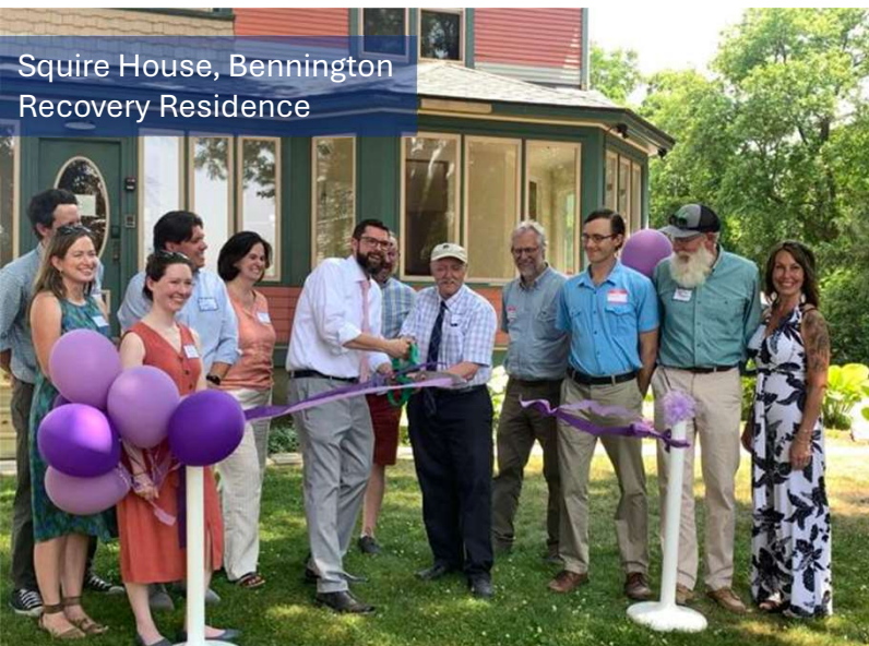
Squire House, Bennington Recovery Residence