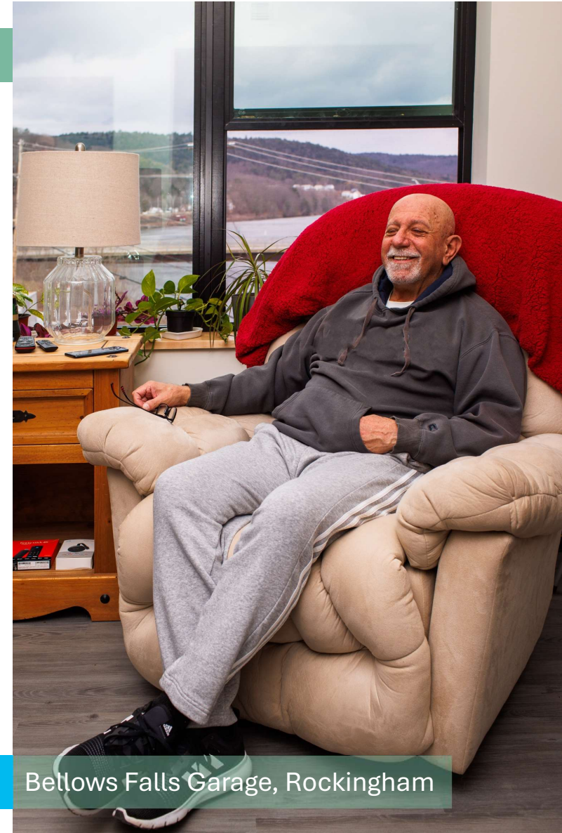
Bellevue Falls Garage, Rockingham

households experiencing homeless that VHCB helped to house since 2020