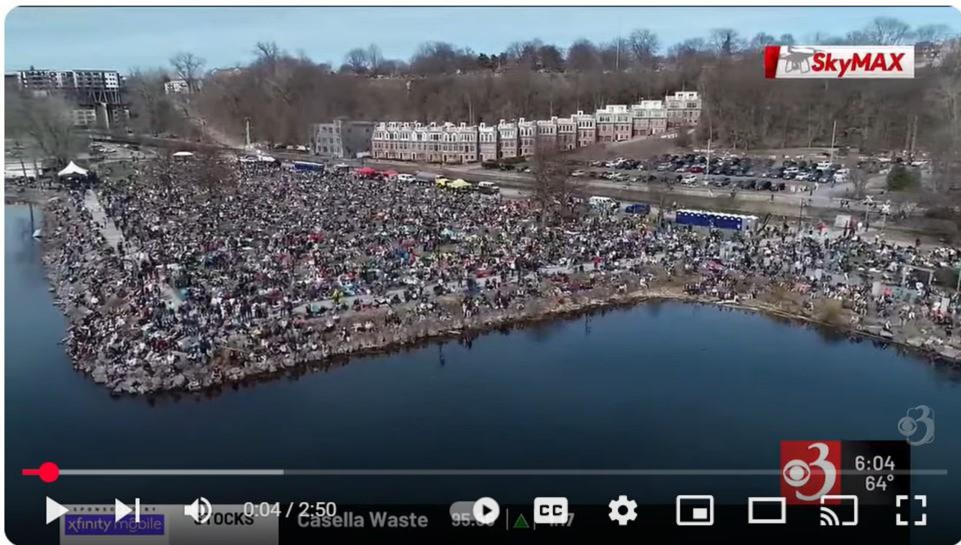
Burlington Waterfront during the Eclipse