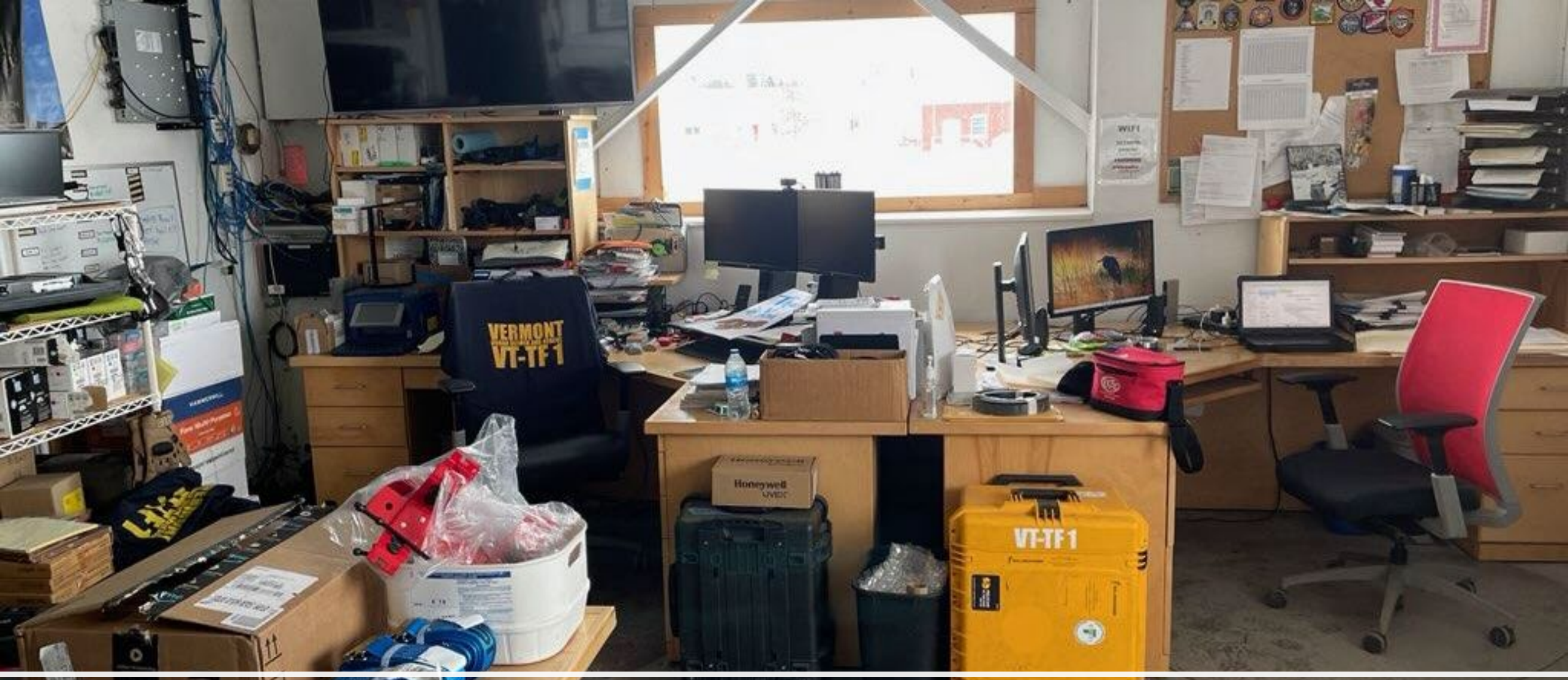
State of Vermont Urban Search and Rescue(USAR) VT-TF1