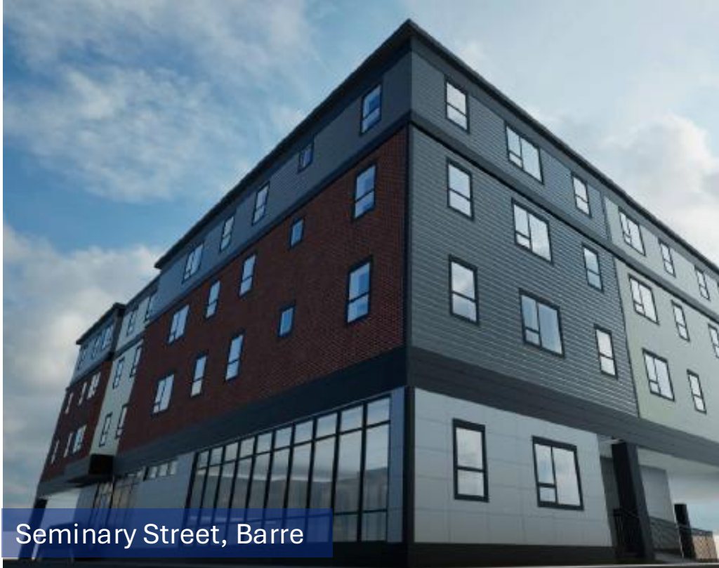
Seminary Street, Barre