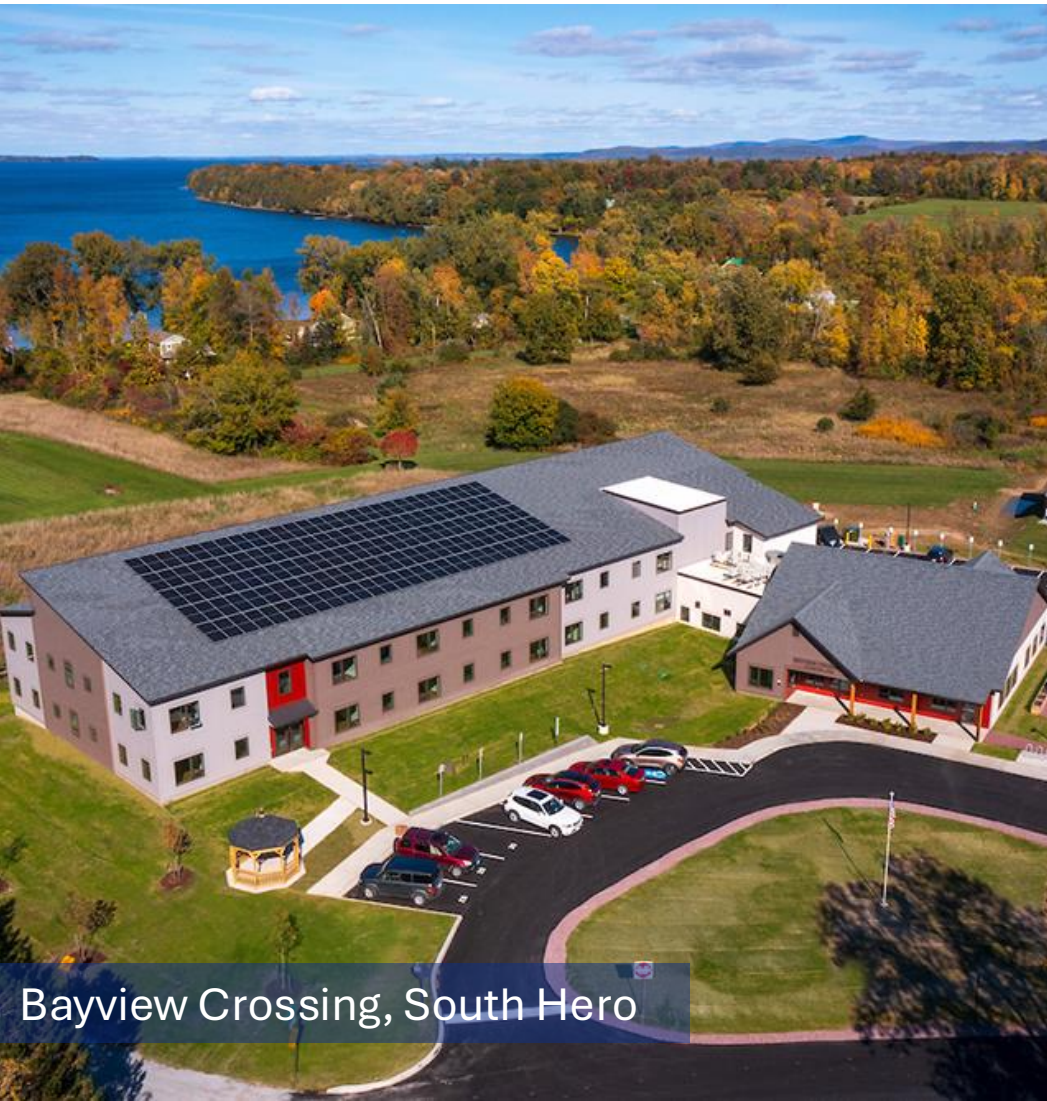
Bayview Crossing, South Hero

(1) $8,600,000 General Fund to provide support and enhance capacity for the production and preservation of affordable mixed-income rental housing and homeownership units, including improvements to manufactured homes and communities, permanent homes and emergency shelter for those experiencing homelessness, recovery residences, and housing available to farm workers, refugees, and individuals who are eligible to receive Medicaid-funded home- and community-based services; and