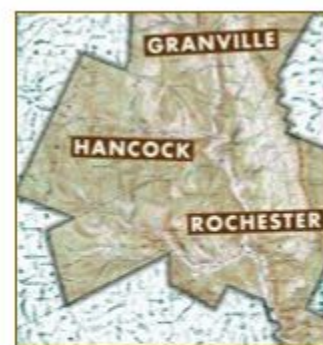
FEEDING THE VALLEY ALLIANCE