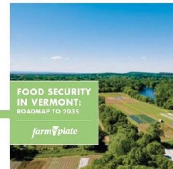
FOOD SECURITY IN VERMONT: ROADMAP TO 2035