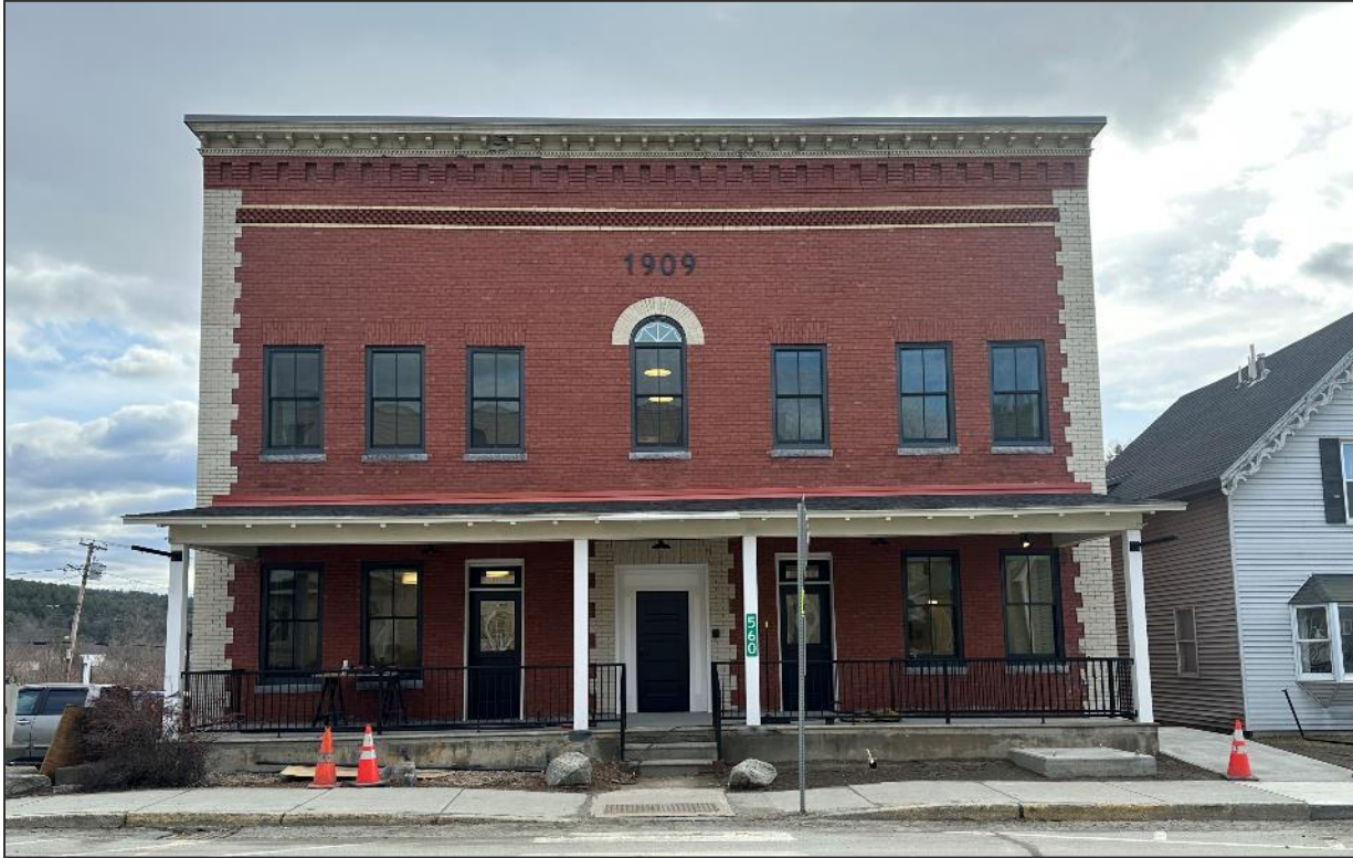
560 Railroad Street, St. Johnsbury