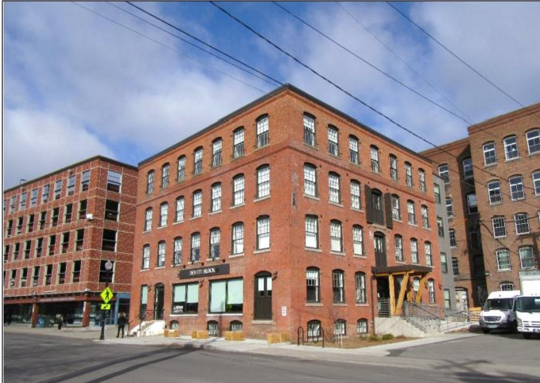
Emerson DeWitt Warehouse, Brattleboro