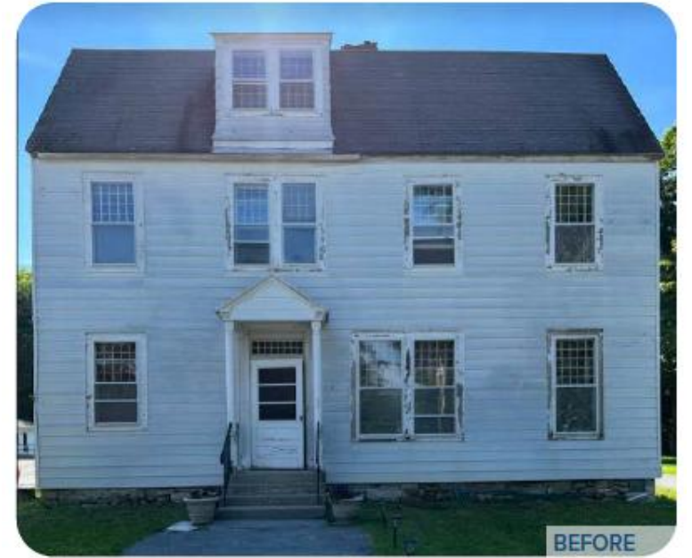
Watkins House, Arlington