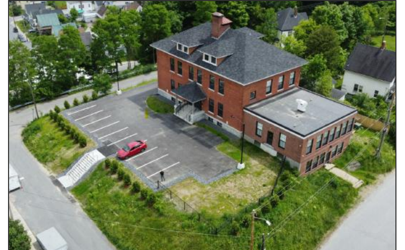
Ward 5 School, Barre