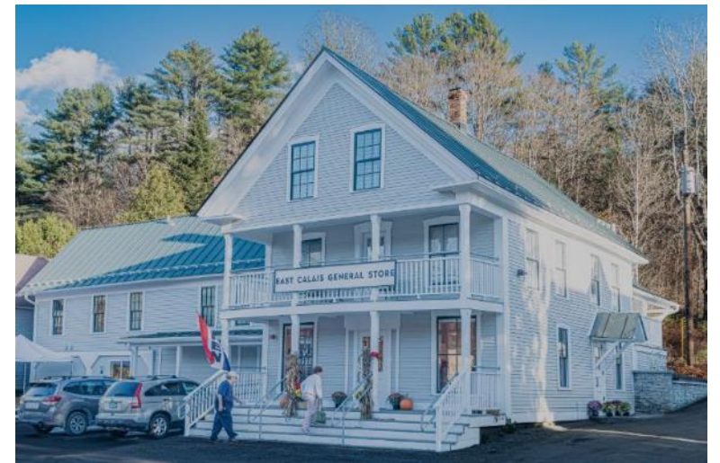
East Calais General Store