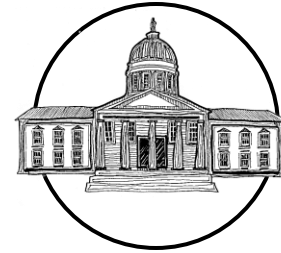
State Pays the Rest