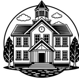
School Districts Pay the FGA