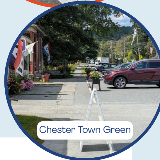
Chester Town Green