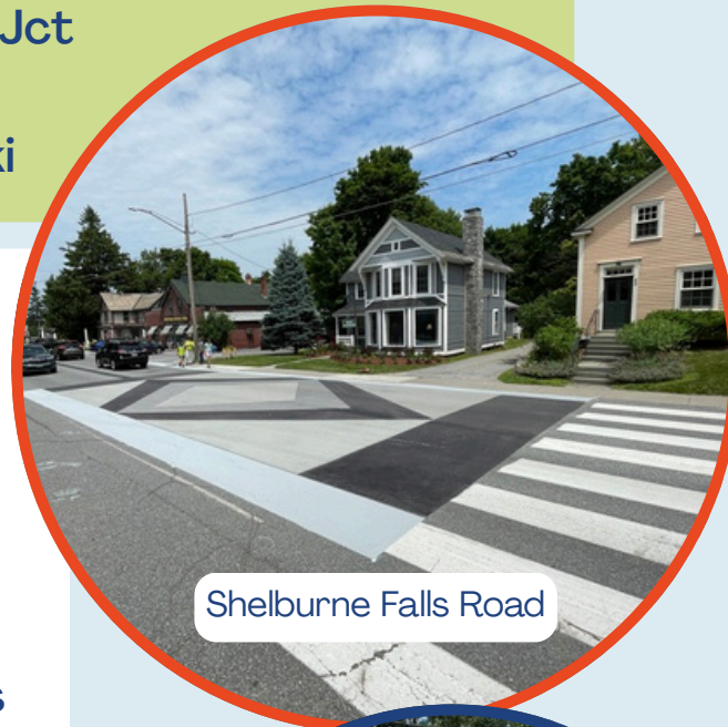
Shelburne Falls Road