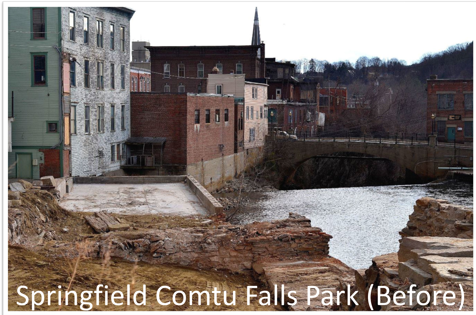
Springfield Comtu Falls Park (Before)