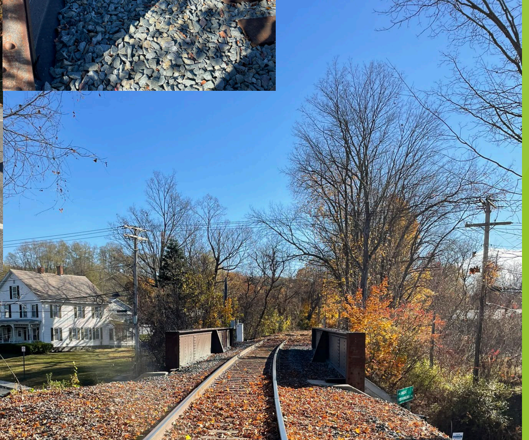
Hoosick Bridge 601