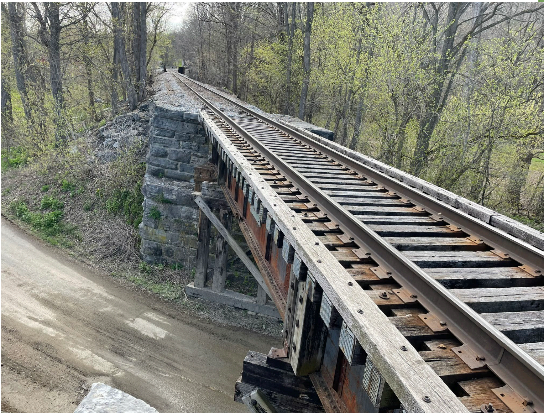
Hoosick Bridge 603 Pre-existing