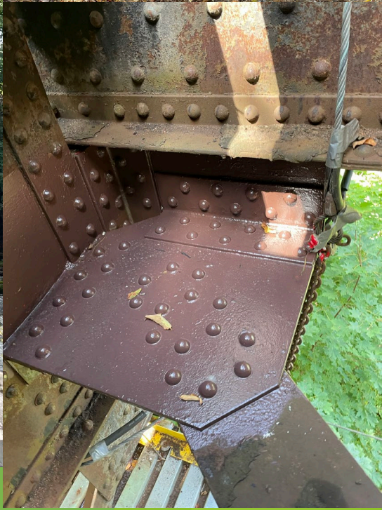
Hoosick Bridge 600