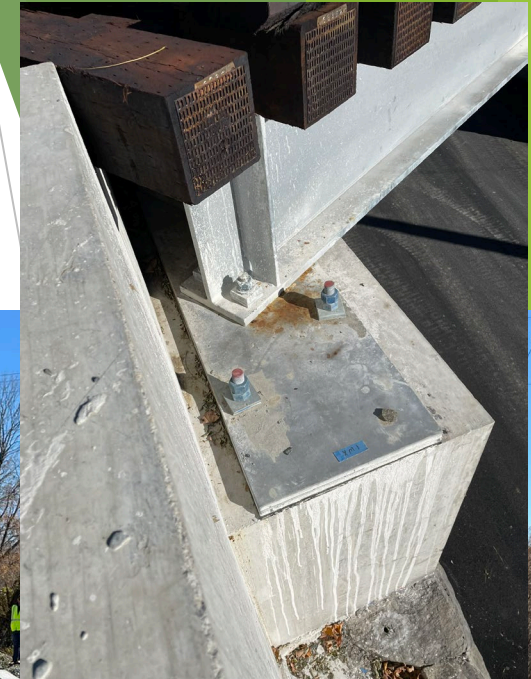
Hoosick Bridge 603 complete