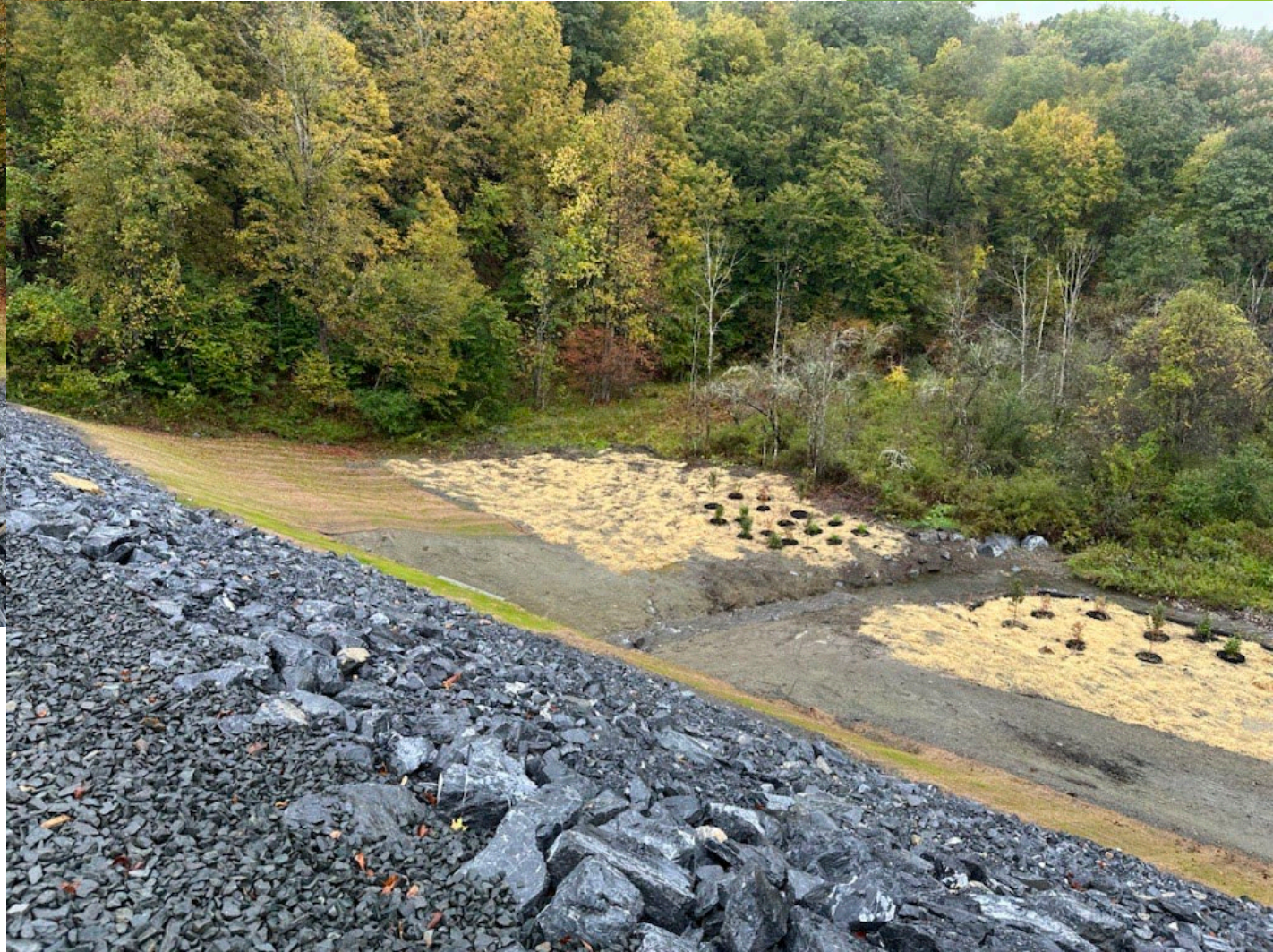
Shaftsbury Bridge 57.5