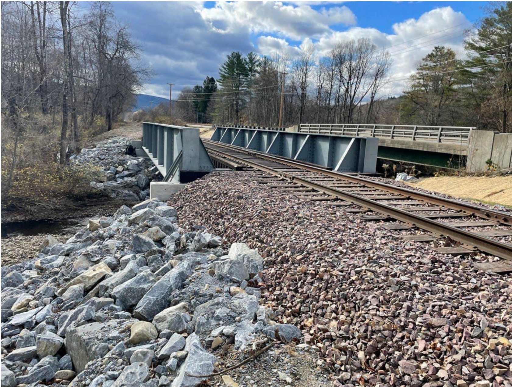
Dorset Bridge 77 Complete