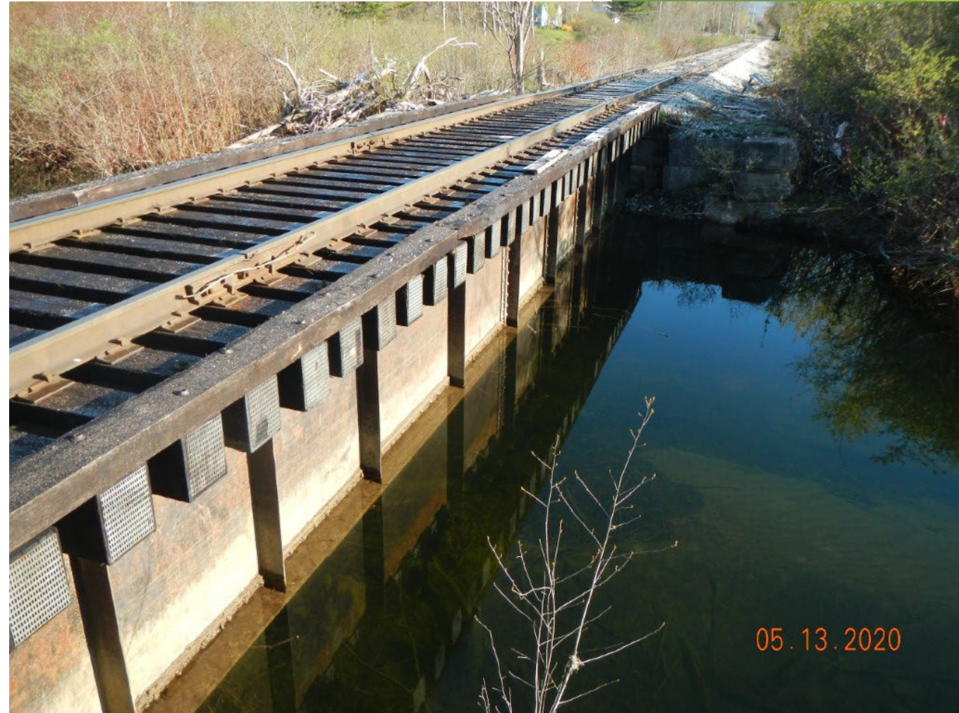
Dorset Bridge 76 Pre-existing