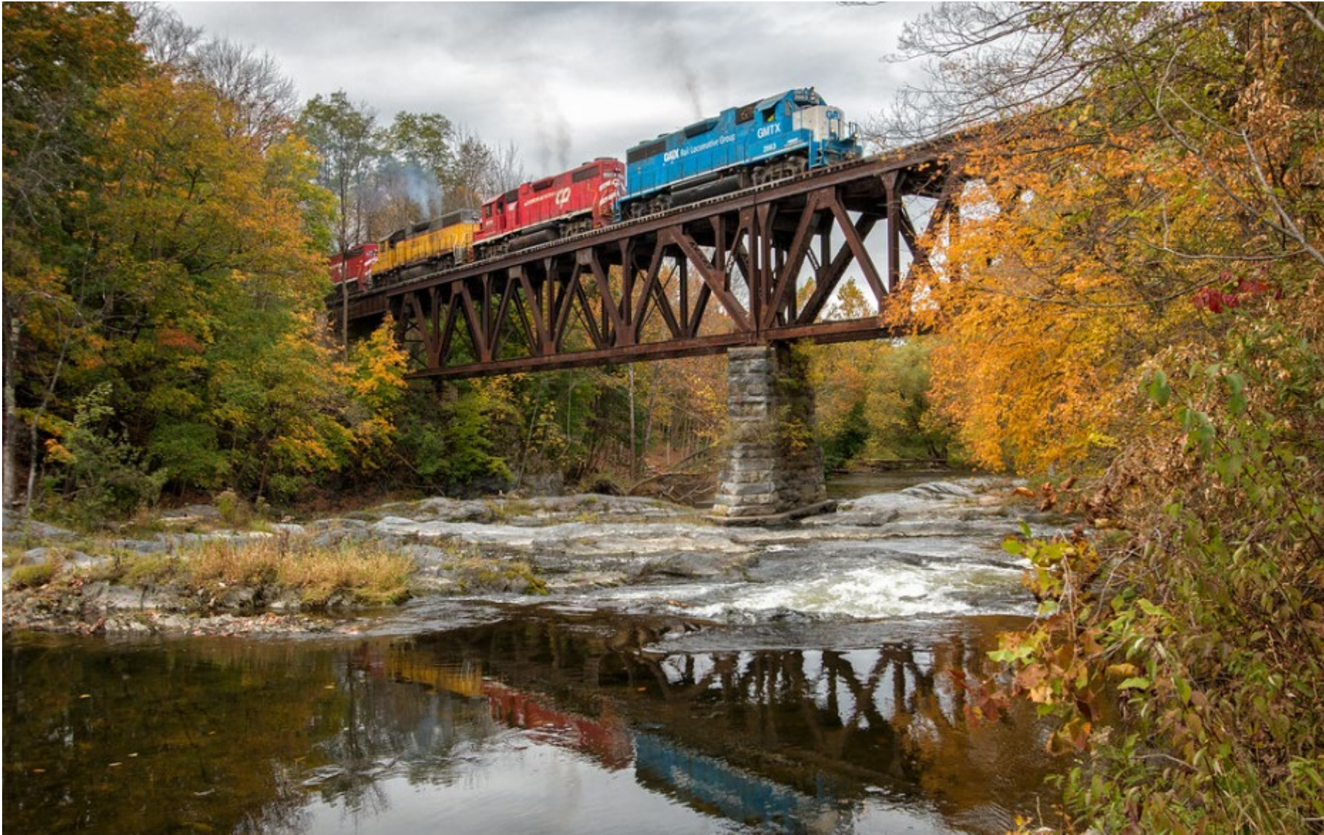
Hoosick Bridge 600 Pre-existing