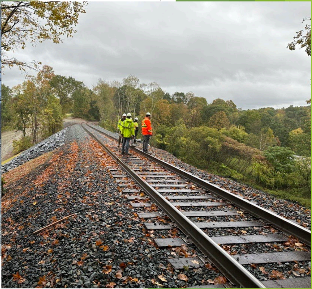
Shaftsbury Bridge 57.5