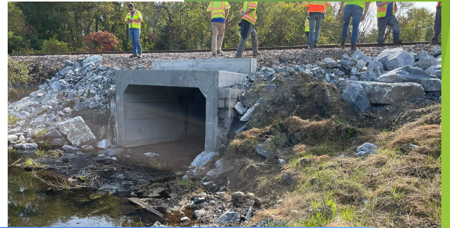
Shaftsbury Bridge 58