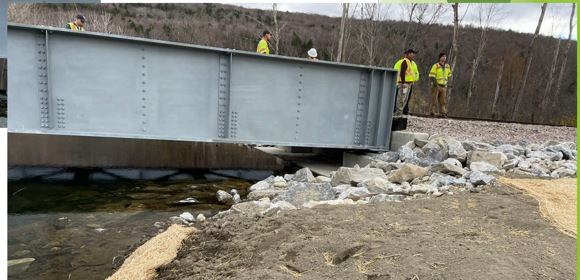
Dorset Bridge 76 Complete