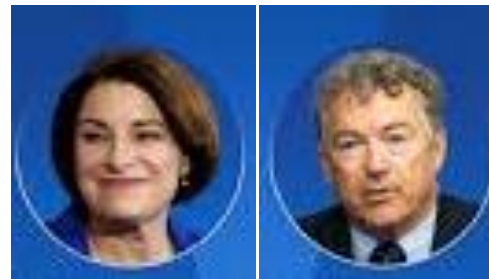
Senator Amy Klobuchar