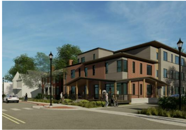
Marsh House was awarded tax credits in 2024 for construction of 26 affordable, highly energy efficient apartments in downtown Waterbury.

VHFA finances home mortgages to low and moderate income buyers through participating lenders statewide. In 2024, 357 homebuyers used a VHFA mortgage. 90% were first-time buyers, 95% attended a VHFA homebuyer education course and 55% received down payment assistance from VHFA. Fifty-six of these homebuyers received grants through the First Generation Homebuyer program. VHFA also awarded state tax credits to support the development of 36 new owner-occupied homes.