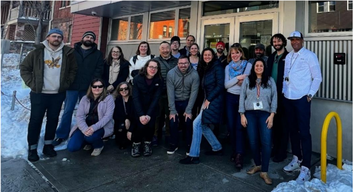
VHFA staff at King Street Youth Center in May 2024.

“For 50 years, Vermont Housing Finance Agency has expanded housing opportunities through innovative financing and programs and data-driven decision making. But this work is done in community , in partnership with dedicated individuals and with federal, state and local agencies. It takes all of us.”