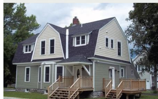
A Rutland home renovated through the Housing Assistance Rehabilitation Program.