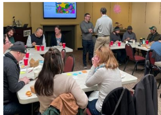
The VHFA staff JEDI retreat in FY2024 moved between several neighborhood locations throughout the day, including the Burlington Free Library, King Street Youth Center and the VHFA building.

VHFA's role in preserving and supporting the neighborhood goes back nearly as long as the agency's history. In 1982, VHFA and the City of Burlington worked together to rehabilitate the 10-block historic district. Later in 2001, VHFA worked to preserve two apartment buildings in the district to ensure they would continue to operate affordably and safely in the long-run.