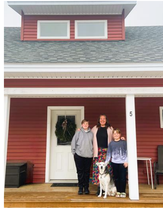
Homebuyers at their new home in Rutland built through Middle-Income Homeownership Development Program in 2024.

Of those, 147 homes are intended for Vermonters exiting homelessness. The HIVE Fund builds on VHFA’s long track record of strategic and careful leveraging public and private sources to achieve state, regional, and local community development goals. Pairing HIVE with other state and federal funding also links the investments to those sources’ rigorous long-term compliance standards. Projects that receive HIVE investment are well managed, undergo annual ongoing compliance monitoring, and will continue to be safe and affordable homes for residents. Depending on an investor's goals, VHFA will recycle repaid loans from the fund into future projects that meet similar community development goals or return funds to the investor in years to come.