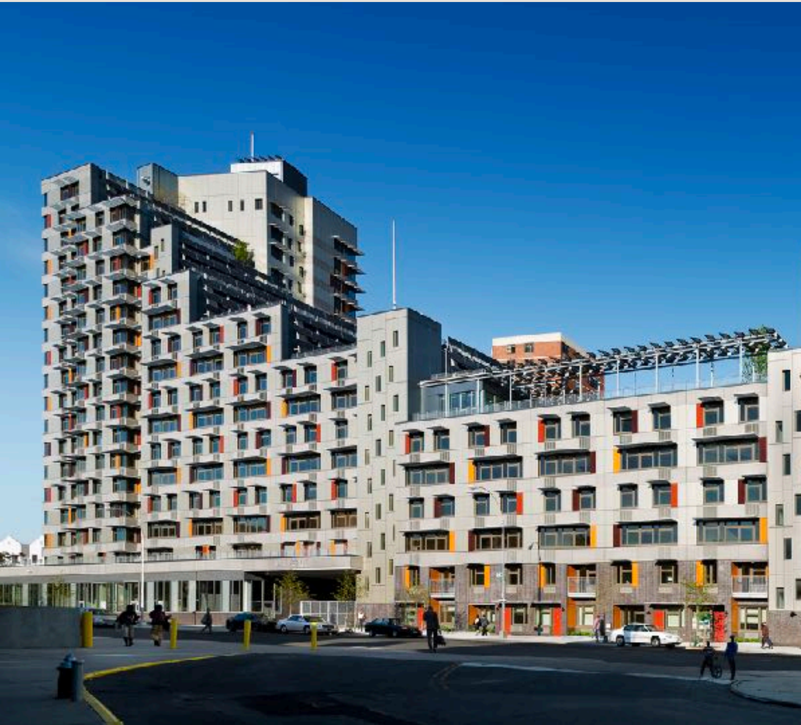
Via Verde, Bronx, NY