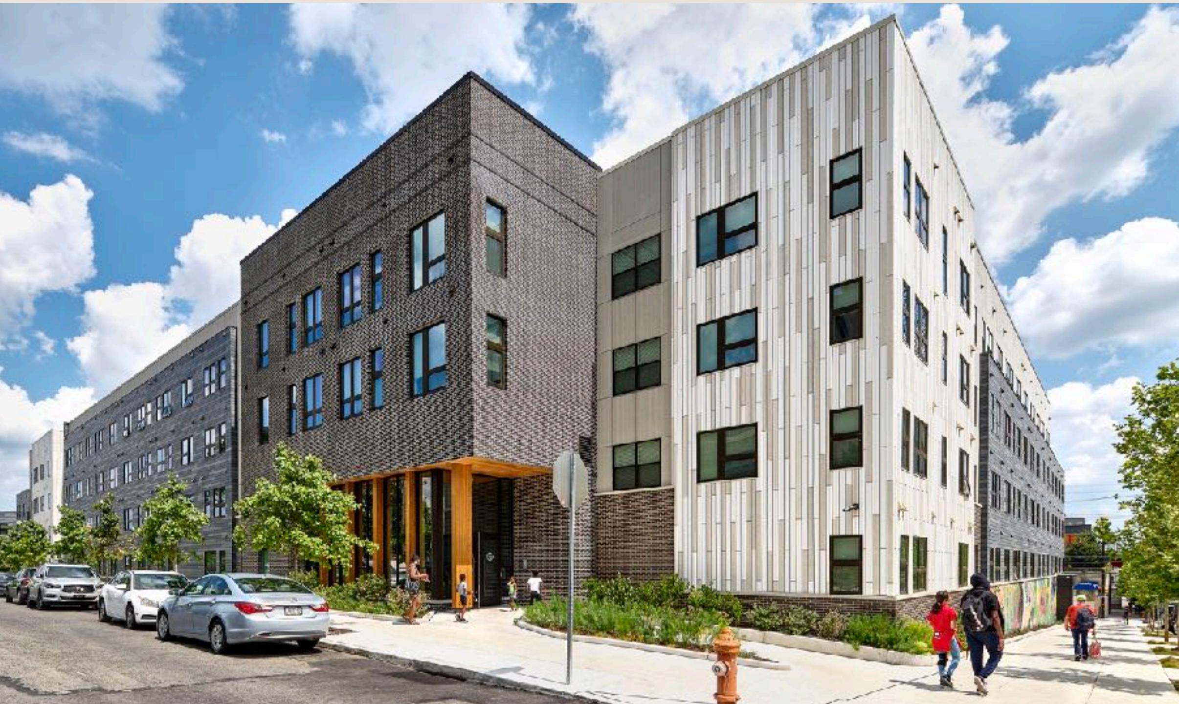
The Faircliff and Novel14, Washington, D.C.