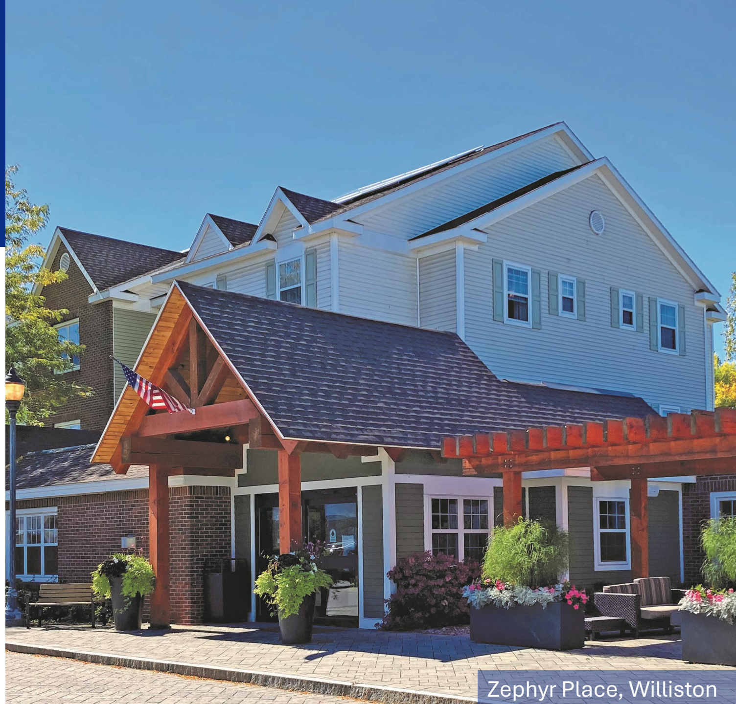
Zephyr Place, Williston