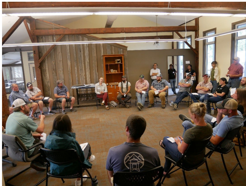
Figure 1. A group of farmers and agricultural technical assistance providers discuss manure injection with the Champlain Valley Farmer Coalition in Addison County.

Learn more about current and historic investments and grant-funded practice implementation in the Water Quality Division – Interactive Data Report .