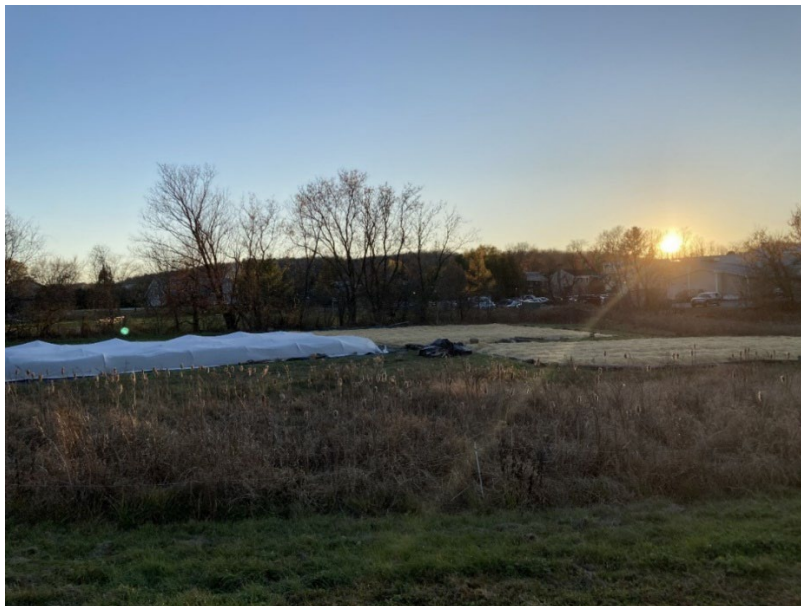
Figure 8. Fall evening view of mulched crop beds at Trillium Hill Farm in Hinesburg

In June of 2024, James Donegan of Trillium Hill Farm, LLC worked alongside planners from the United States Department of Agriculture Natural Resources Conservation Service (USDA NRCS) to enroll their 67 acres of agricultural land into the Conservation Stewardship