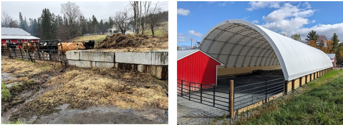
Figure 2. (Left) Uncovered barnyard had runoff issues in wet conditions. (Right) New covered barnyard area provides a clean area for manure storage and livestock and eliminates runoff concerns.