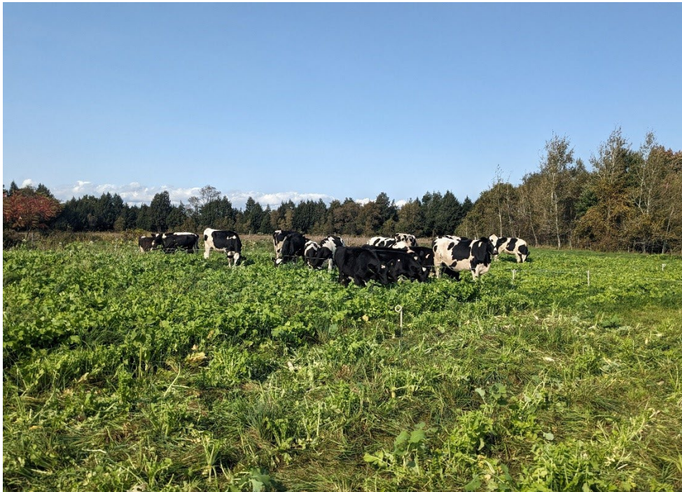
Figure 9. Rotational grazing of dairy herd at Choiniere Family Farm in Highgate Center.

Since early 2022, VAAFAM has contracted the Vermont Association of Conservation Districts to provide local and regional technical assistance under the VPFM Program. The Franklin County Natural Resources Conservation District (FCNRCD) has partnered with 32 farms in Franklin and Grand Isle counties to implement the Vermont Pay for Performance Program. FCNRCD provides key technical assistance, helping farmers with data entry, verification, and ensuring their practices align with program requirements. This partnership has strengthened the district's relationships with farmers, including those new to the district, and supports them in maintaining and implementing up-to-date Nutrient Management Plans through regular sampling and farm visits.