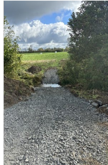
Figure 3. (Left) Trees and shrubs planted in the newly established riparian buffer zone. (Right) Stream crossing installed to enable livestock crossing with reduced impacts.

In 2024, Cayden Theberge enrolled in the Conservation Reserve Enhancement Program. In addition to the grazing infrastructure improvements made with the Agency’s Pasture and Surface Water Fencing program, Cayden installed a 6-acre riparian forest buffer on Hungerford Brook which runs through the farm’s pastures. The farm is a beef operation which does rotational grazing on their pastures. A stream crossing was installed to allow livestock to cross safely through the stream while limiting impacts to water quality. A fence is currently being installed to exclude livestock from the stream and protect the planted buffer. The Farm Service Agency and U.S. Fish and Wildlife Service covered 100% of the total project implementation costs and the Agency of Agriculture provided an incentive payment of $315 per acre to the farm for enrollment in the program. The Agency of Agriculture also provide technical assistance for the project planning and implementation oversight. The new pasture infrastructure will allow for enhanced rotational grazing management to reduce pasture overgrazing, and the riparian forested buffer will reduce runoff from adjacent pastures while providing improved aquatic organism habitat.