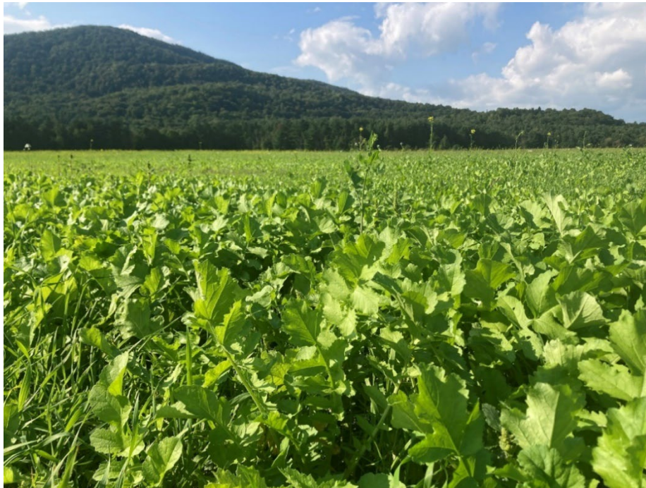
Figure 5. A multispecies cover crop mix of radish and winter rye cover soil and prevent sediment runoff through the winter months while building soil health, sequestering carbon in the soil, and providing additional anti-compaction benefits for the farm.