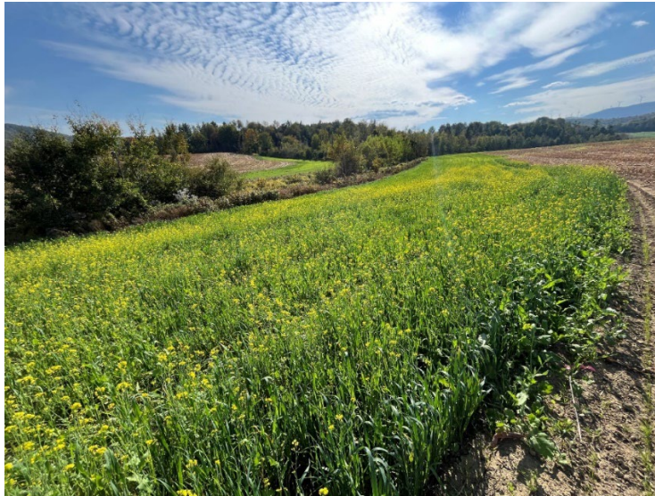
Figure 6: Newly installed Filter Strip adjacent to cropland currently managed in corn.

In August of 2024, with the help of a Seeding and Filter Strip (SFS) program grant, Cy and Dylan Nelson of Nelson Farms VT planted wide, vegetative filter strips along the edges of three of their corn fields which directly border surface waters in the Lake Memphremagog watershed. These 50-ft wide strips of perennial vegetation will help to capture soil and nutrient runoff from their crop fields and prevent it from entering the neighboring stream. Filter strips can be an extremely effective way to protect and promote water quality; according to a 2021 metanalysis led by K.R. Douglas-Mankin, filter strips, on average, help to reduce sediment runoff by 78% and total phosphorus runoff by 63%. The Nelsons will regularly harvest the vegetation growing in the filter strips in the coming years, a practice which will both help them feed their cows and help to improve the filtering performance by encouraging vigorous plant growth and preventing any accumulation of excess nutrients in the filter strip. These vegetated filter strips will help the Nelson's protect local water quality for the next 10+ years.