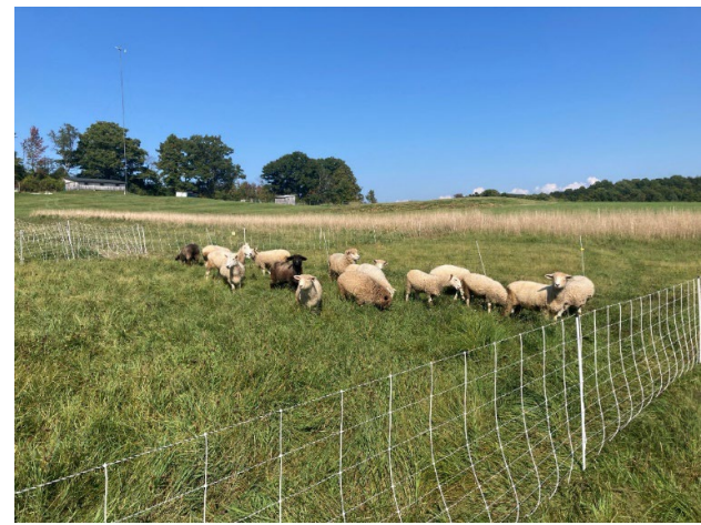
Figure 7. (Left) Perimeter pasture fence and water pipeline. (Right) Sheep grazing in a paddock as part of the farm’s rotational grazing management plan in September 2024.

In 2023, UVM Extension Grazing Specialist Amber Reed (funded in part through AGCWIP) worked with Hands and Heart Farm in Charlotte Vermont to develop a rotational grazing plan and