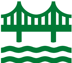
Infrastructure Design & Reinforcement