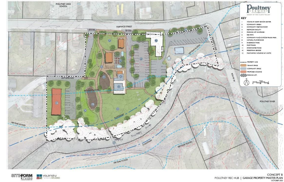
Concept Design for Highway Garage Site Redevelopment

Existing Poultney Highway Garage site. This location is at the southern gateway and is adjacent to Poultney High School, the Young at Heart Senior Center, neighboring residential areas and the Poultney River.