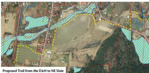
Proposed Trail from the D&H to NE Slate