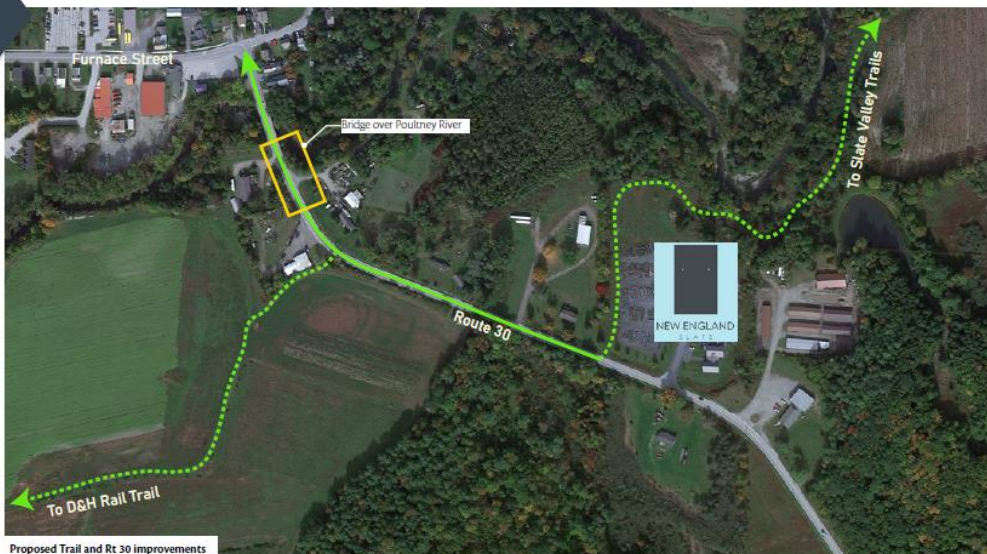
Proposed Trail and Rt 30 improvements