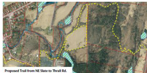
Proposed Trail from NE Slate to Thrall Rd.