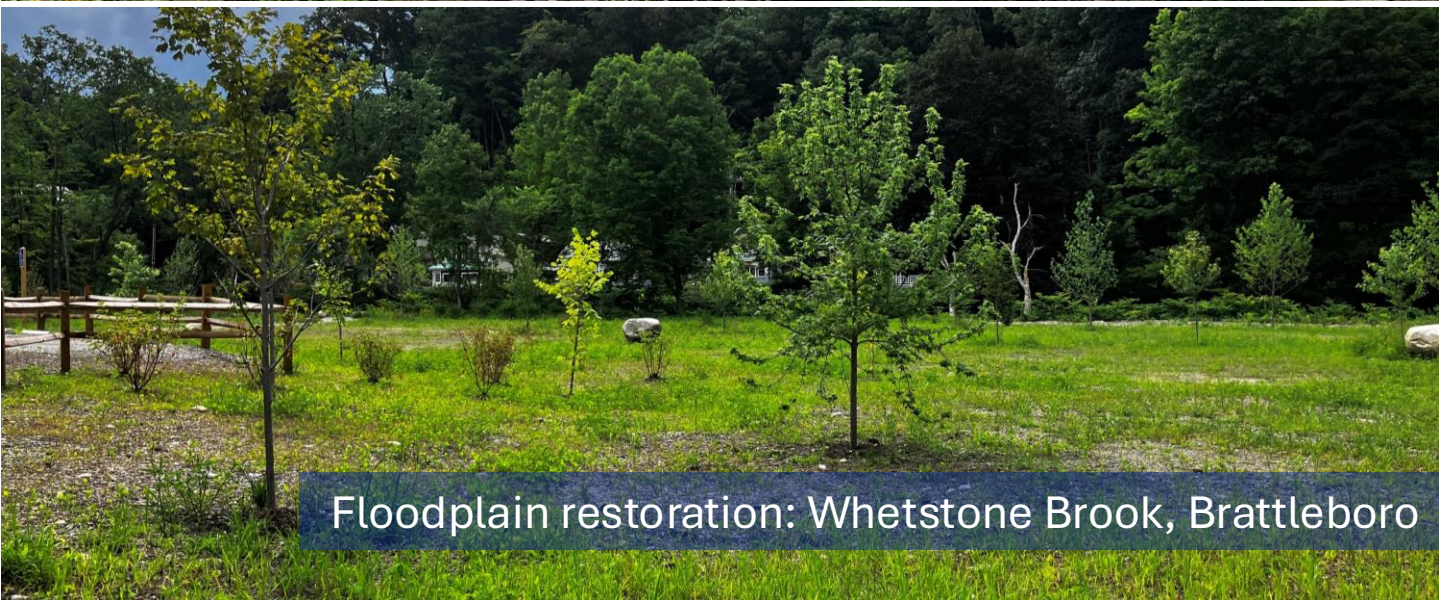
Floodplain restoration: Whetstone Brook, Brattleboro