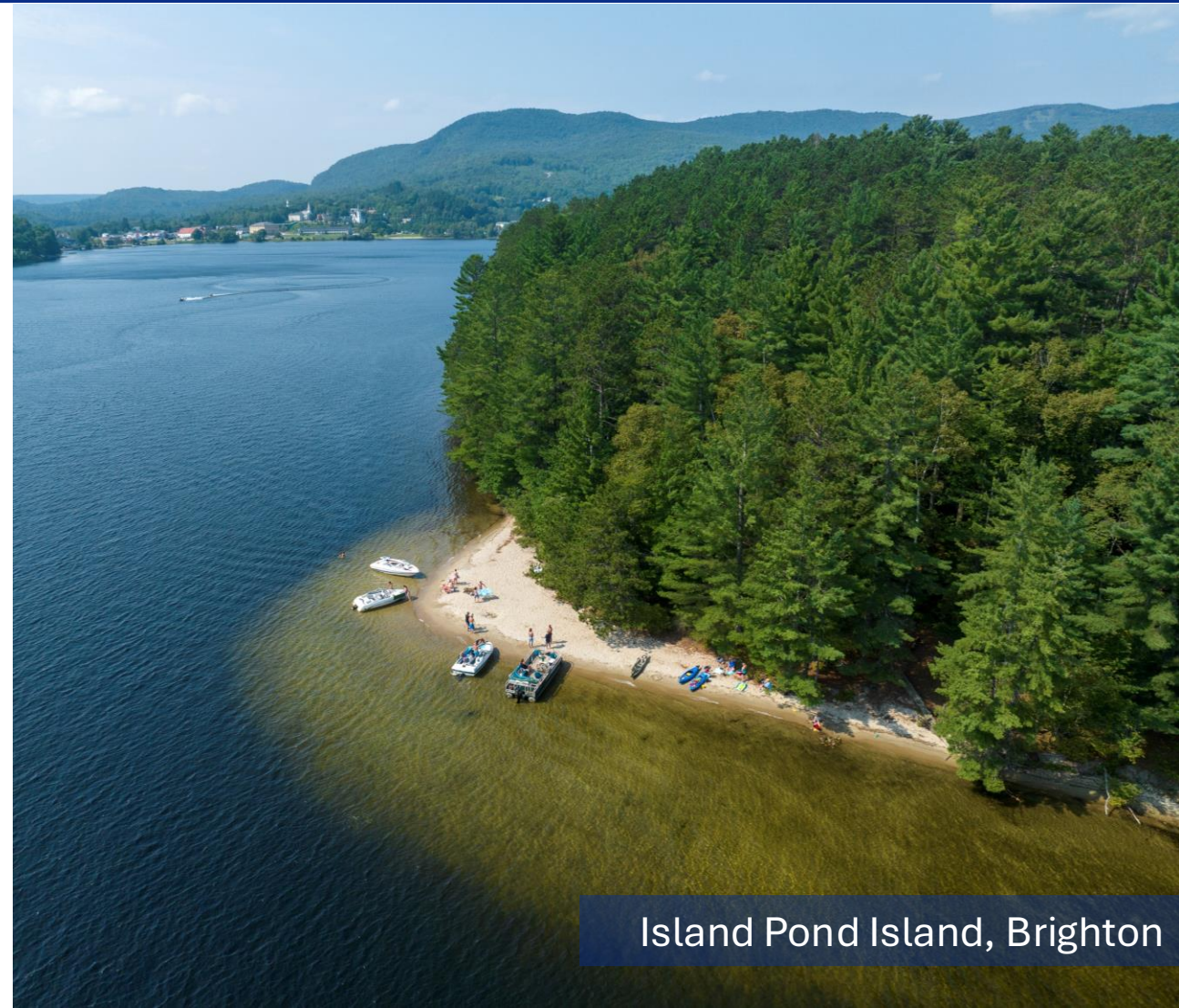
Island Pond Island, Brighton