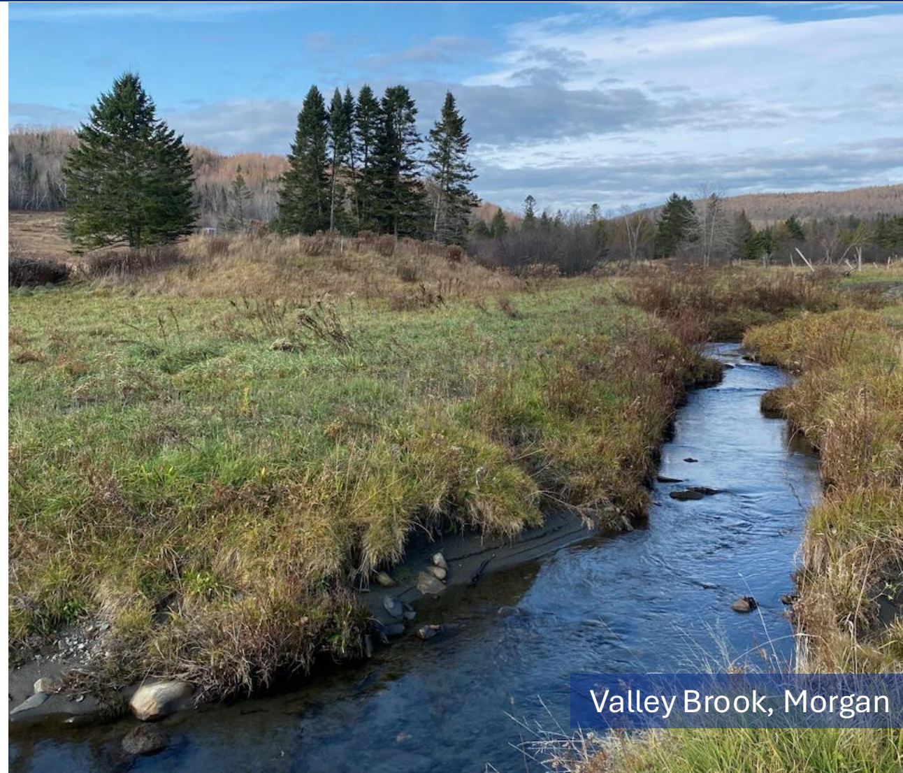
Valley Brook, Morgan