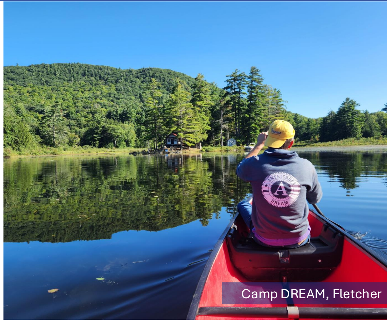
Camp DREAM, Fletcher