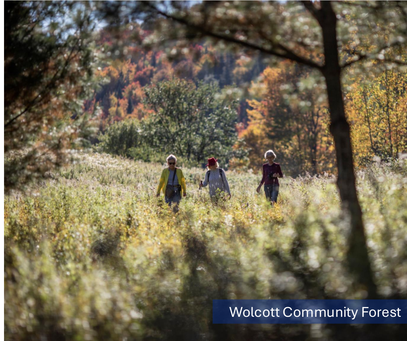
Wolcott Community Forest