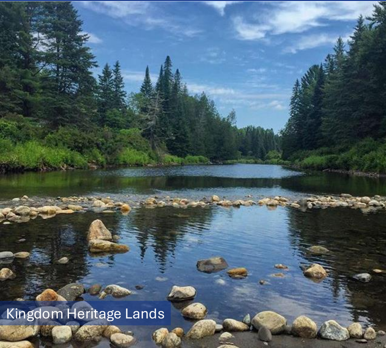
Kingdom Heritage Lands

Act 59 calls for a conservation plan that protects, restores and enhances an ecologically functional and connected, natural and working landscape