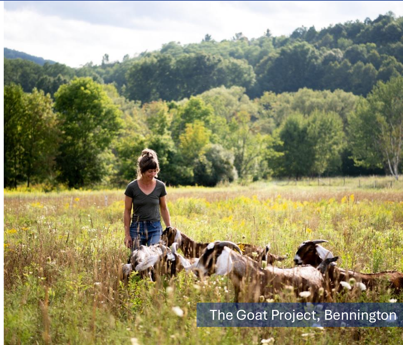
The Goat Project, Bennington