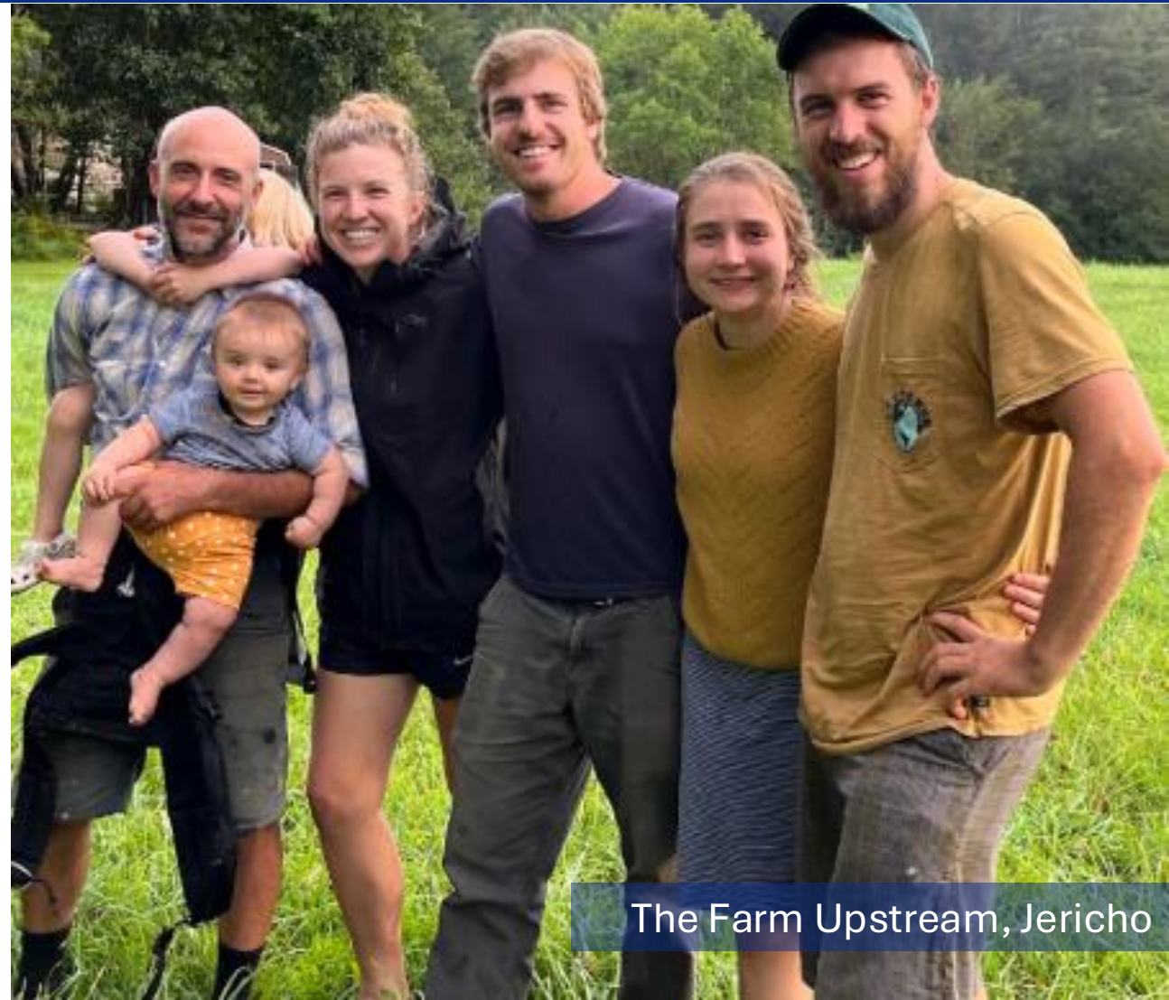
The Farm Upstream, Jericho