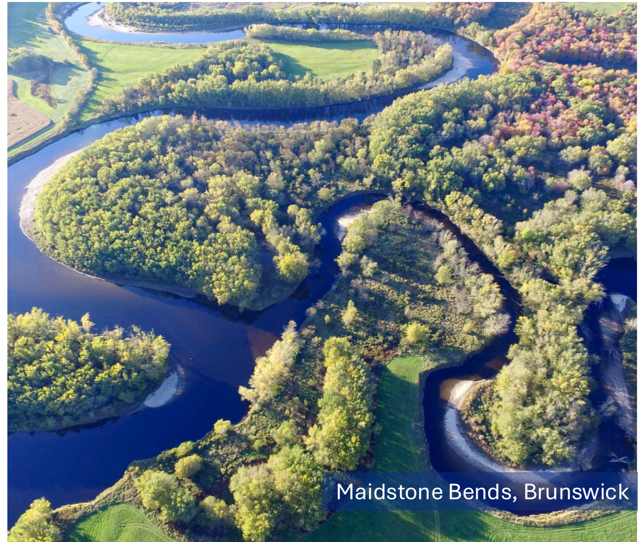
Maidstone Bends, Brunswick