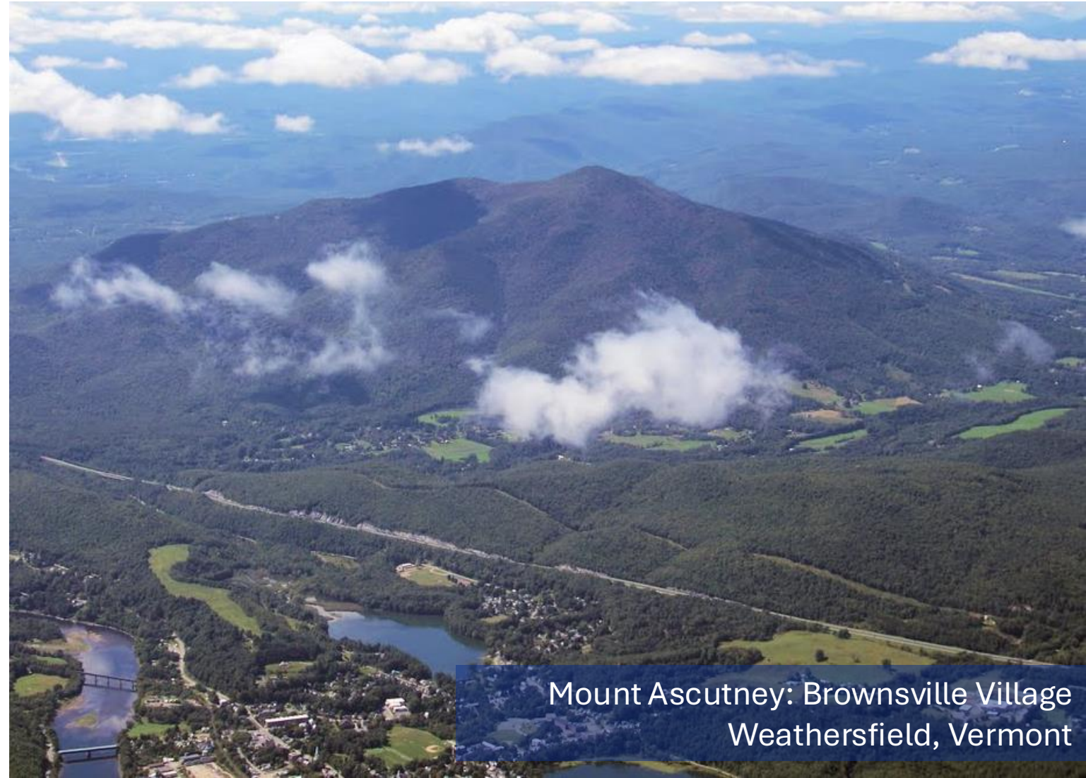
Mount Ascutney: Brownsville Village Weathersfield, Vermont