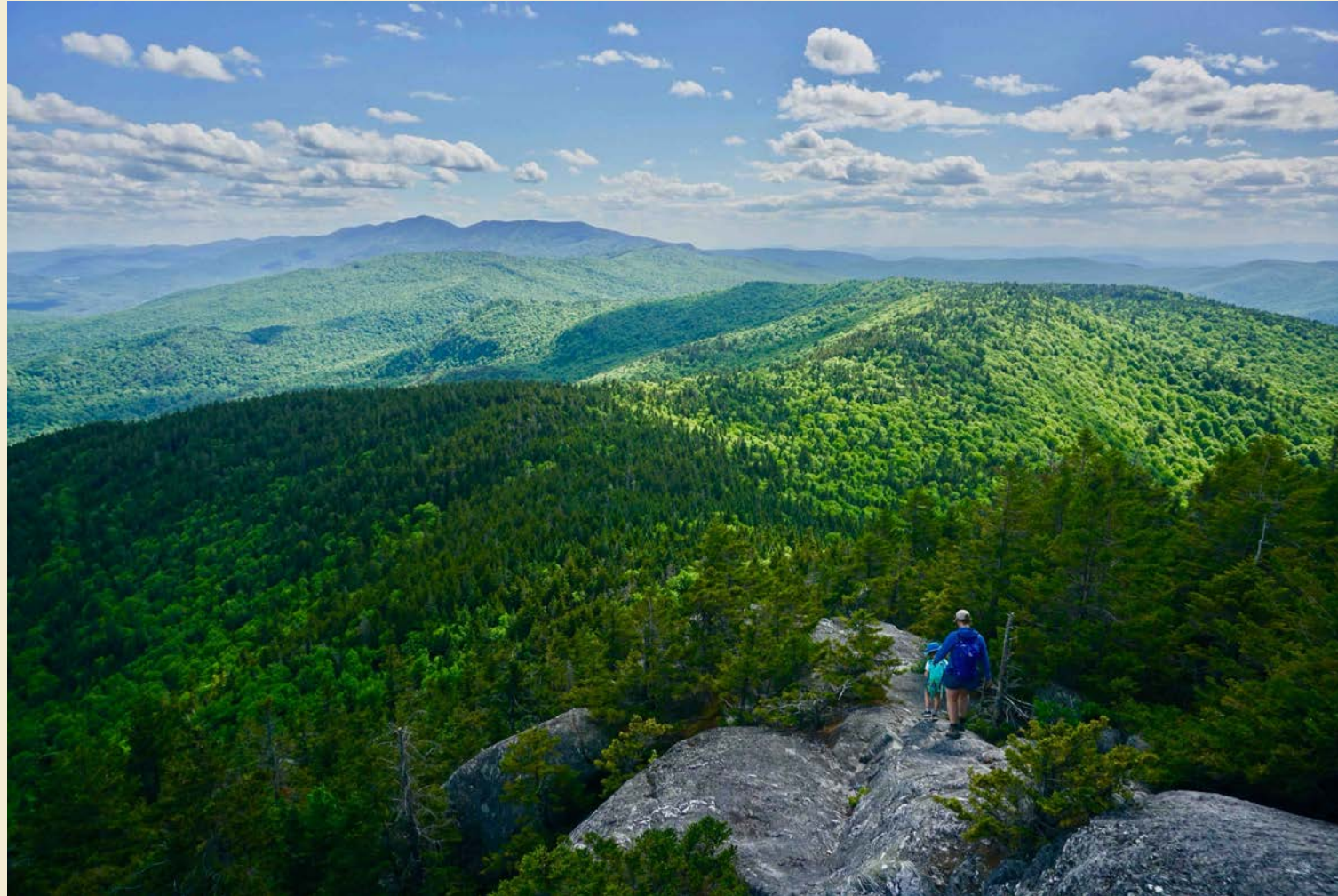
Camel's Hump State Park / Zack Porter