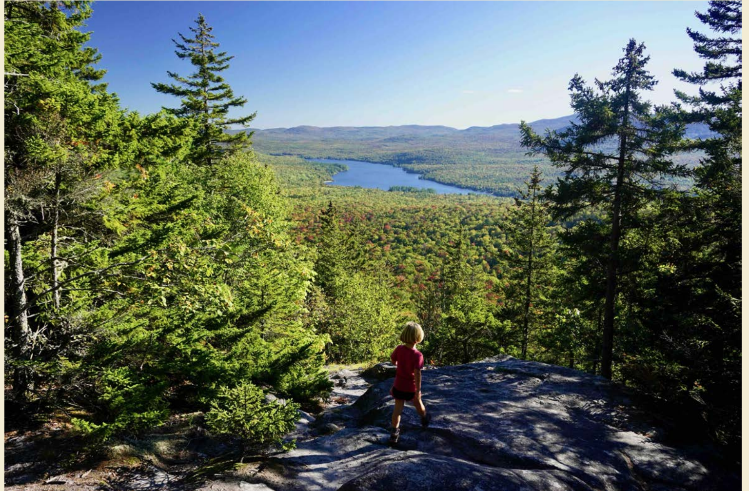
Groton State Forest / Zack Porter