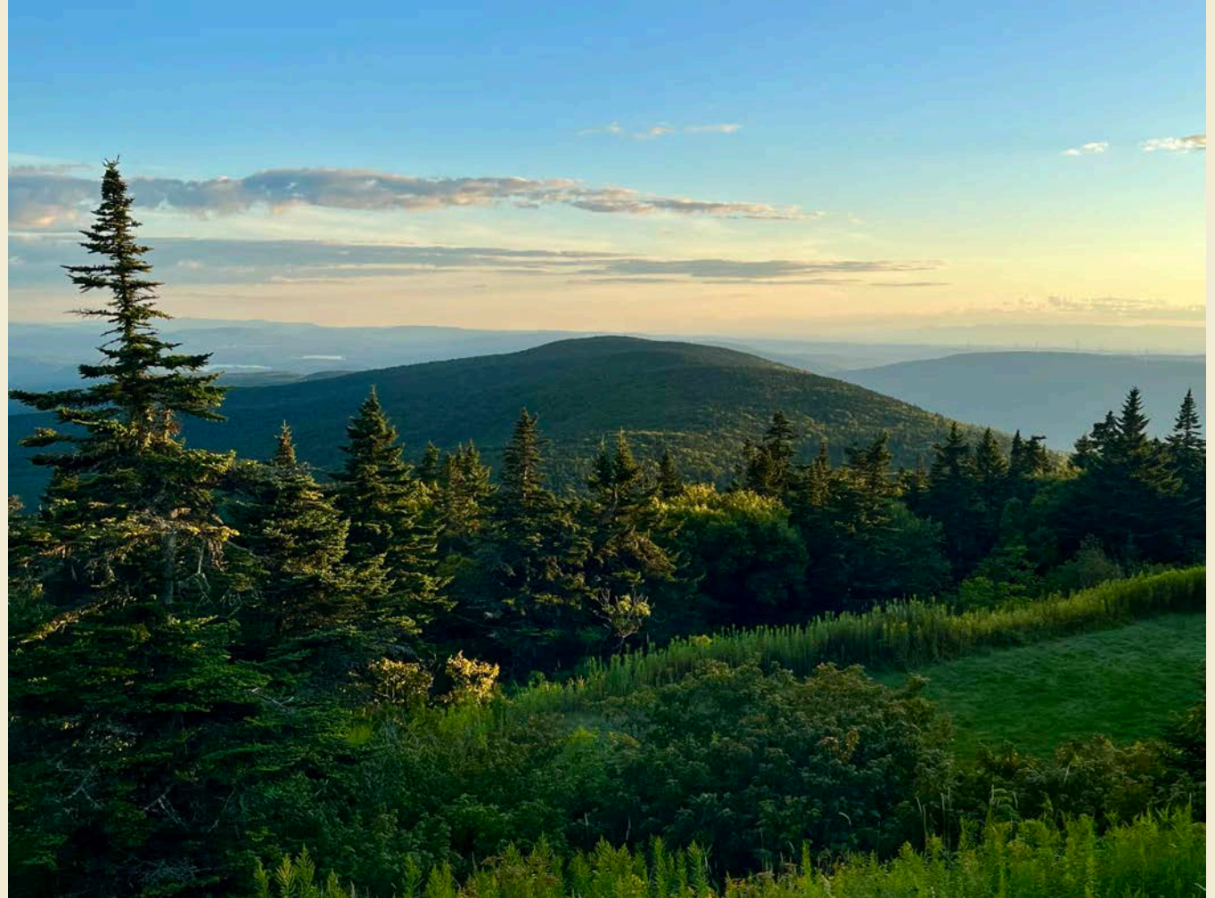
View to the southwest from Mount Greylock State Reservation / Michael Kellett