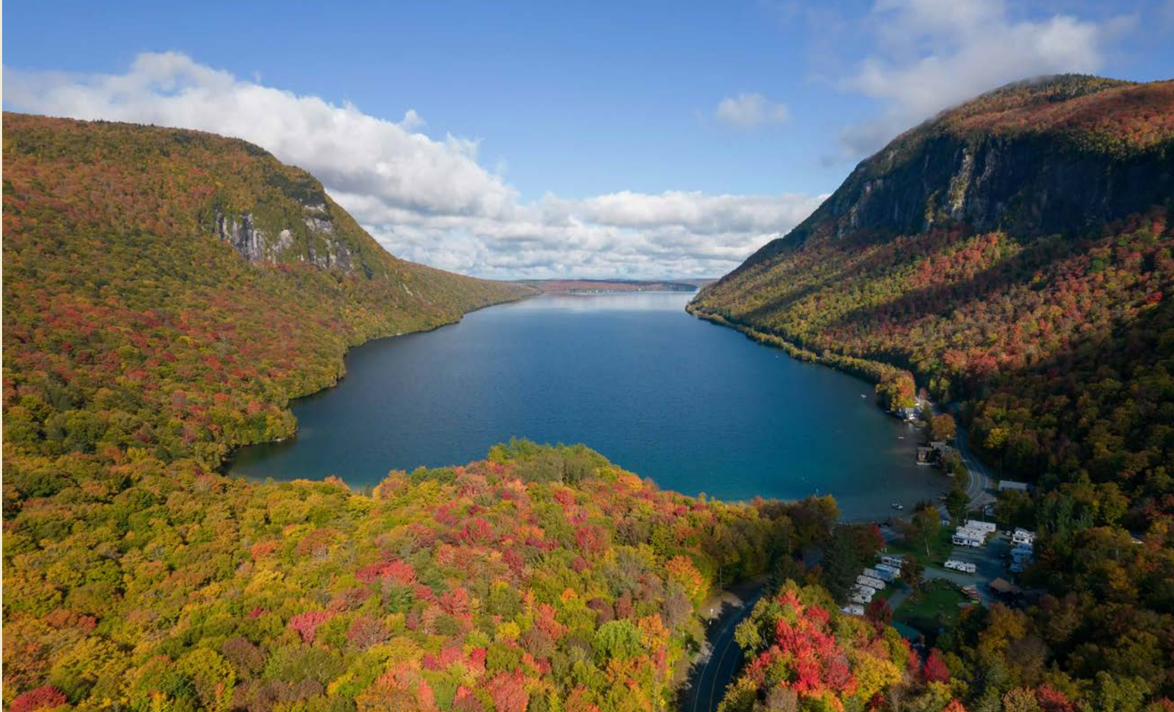
Lake Willoughby looking north