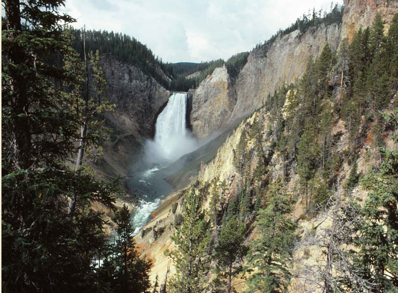
Yellowstone Falls, Yellowstone National Park