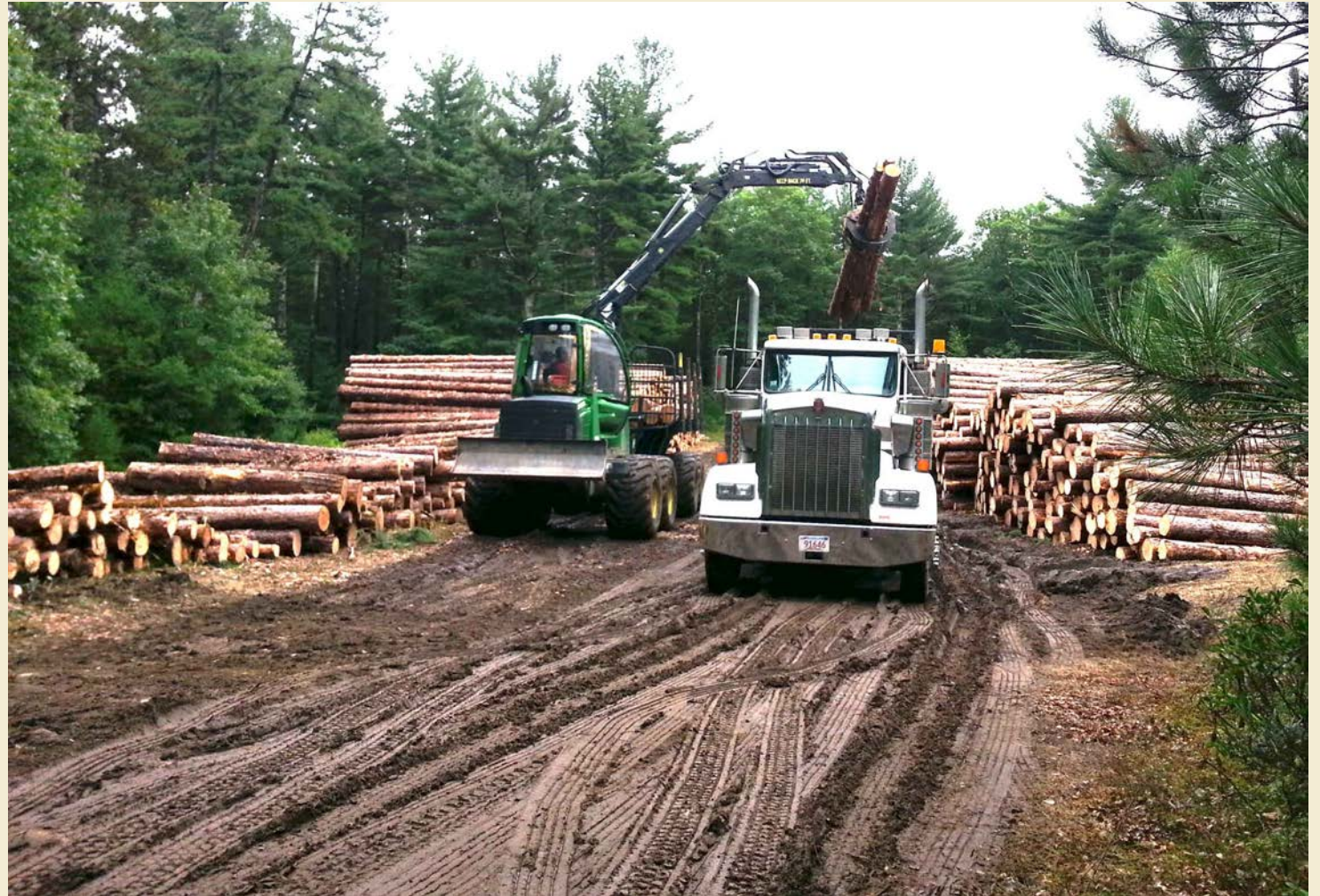
Wendell State Forest, Massachusetts