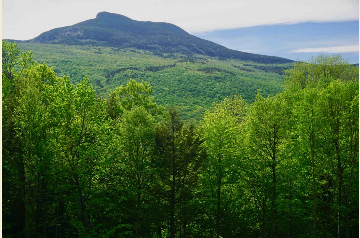
Camel's Hump State Park, Vermont / Zack Porter