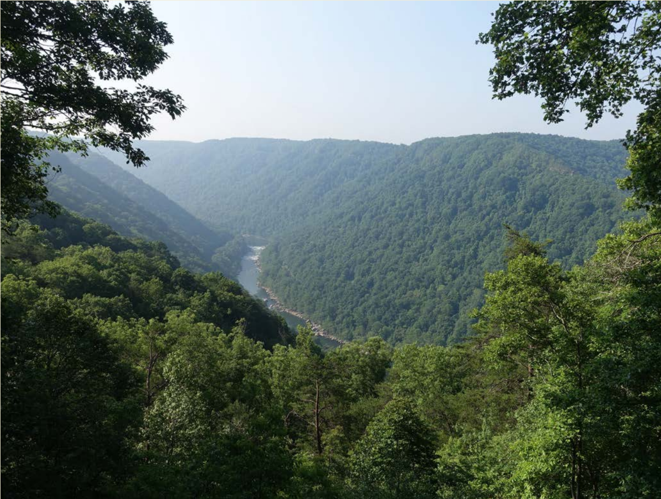
New River Gorge National Park and Preserve