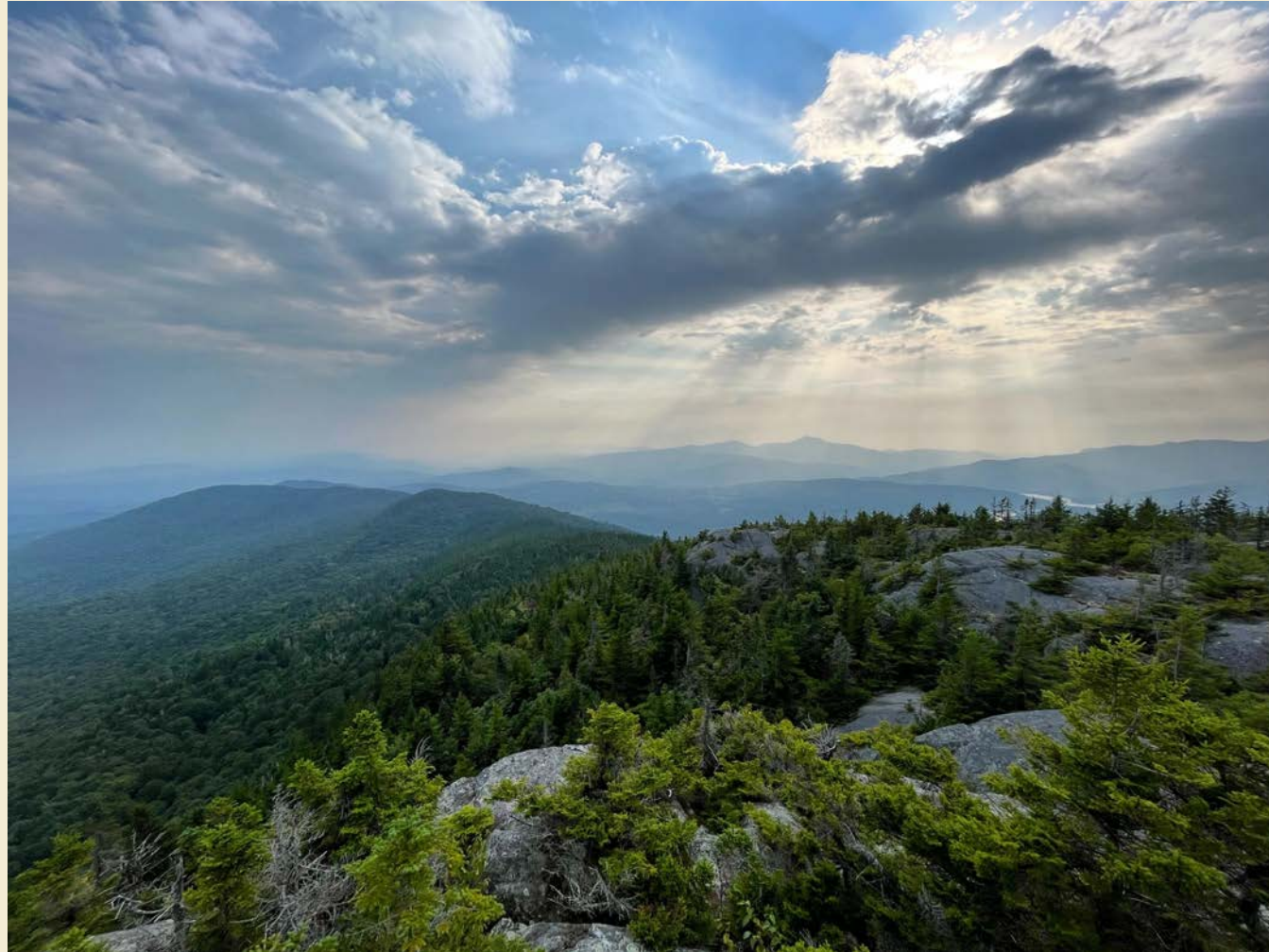
CC Putnam State Forest, Worcester Range