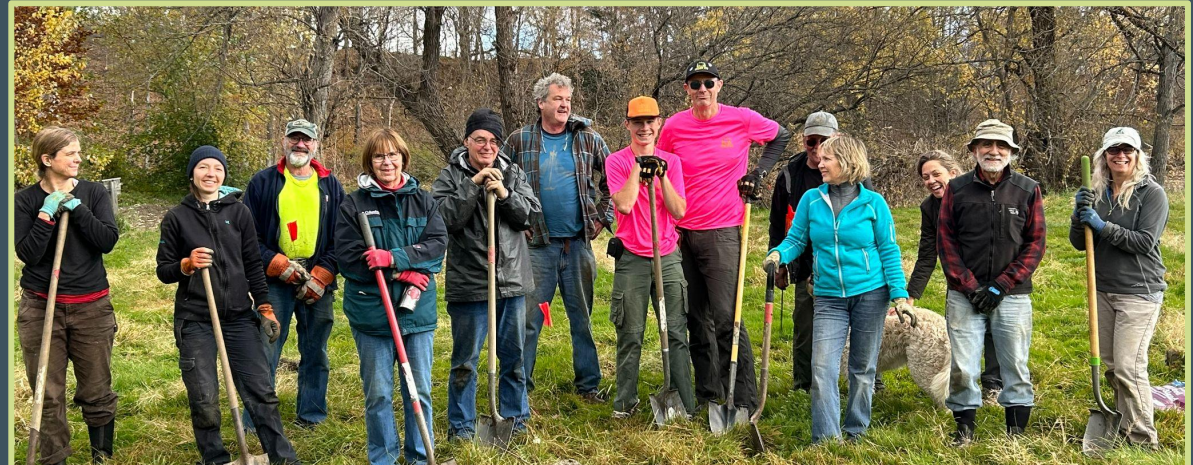
Education & Outreach