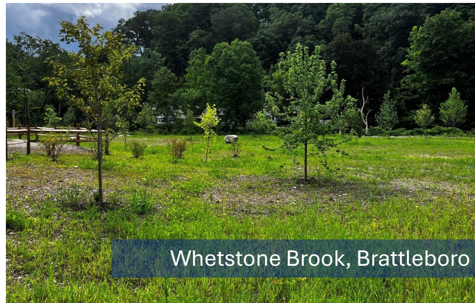
Whetstone Brook, Brattleboro