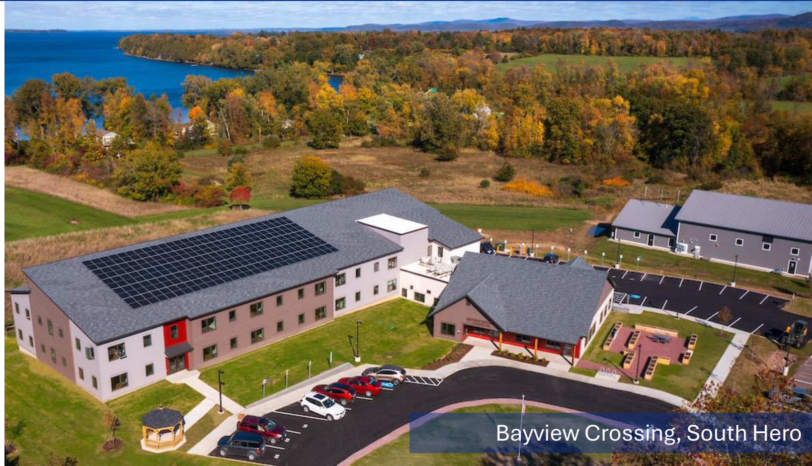
Bayview Crossing, South Hero

Director of Asset Management and Project Design