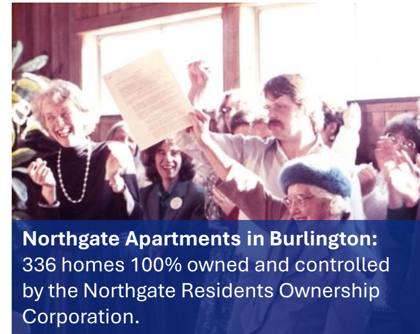
Northgate Apartments in Burlington: 336 homes 100% owned and controlled by the Northgate Residents Ownership Corporation.