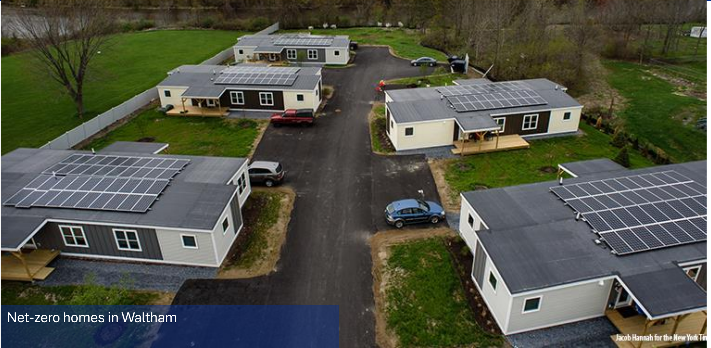
Net-zero homes in Waltham