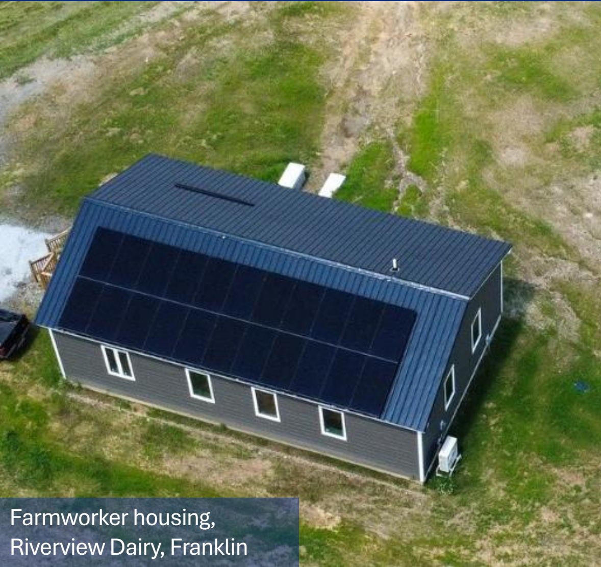
Farmworker housing, Riverview Dairy, Franklin