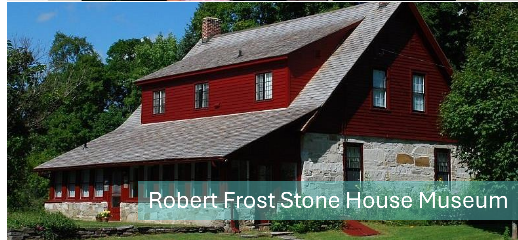
Robert Frost Stone House Museum