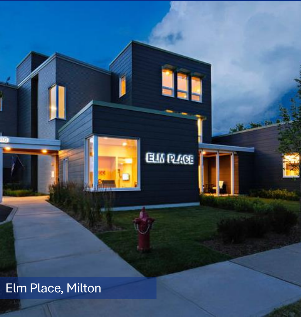
Elm Place, Milton