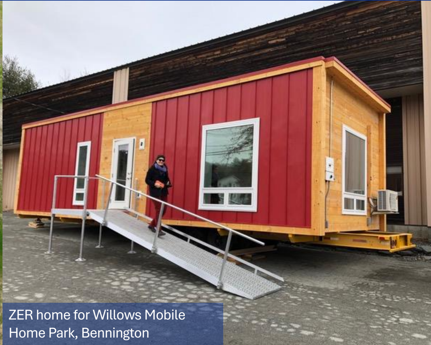
ZER home for Willows Mobile Home Park, Bennington