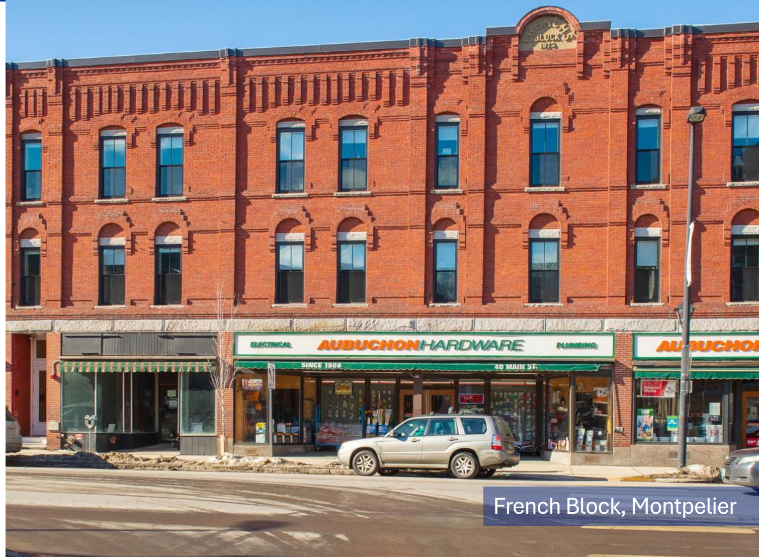
French Block, Montpelier