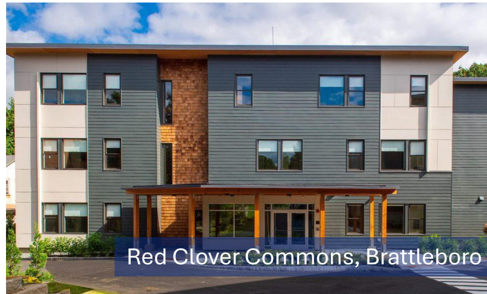
Red Clover Commons, Brattleboro