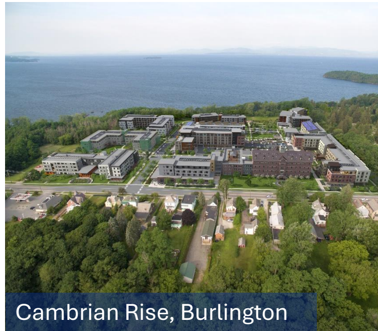
Cambrian Rise, Burlington