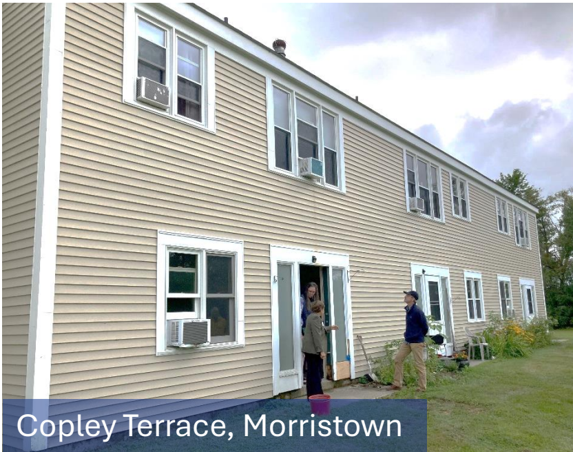
Copley Terrace, Morristown