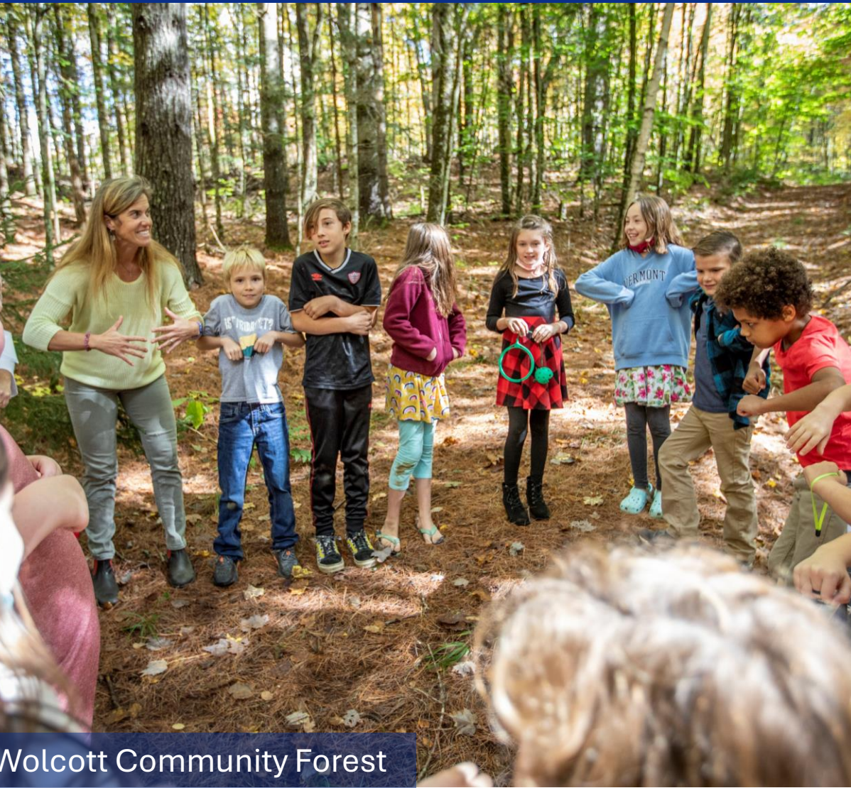
Wolcott Community Forest

22,674 acres conserved across 25 towns in 10 counties