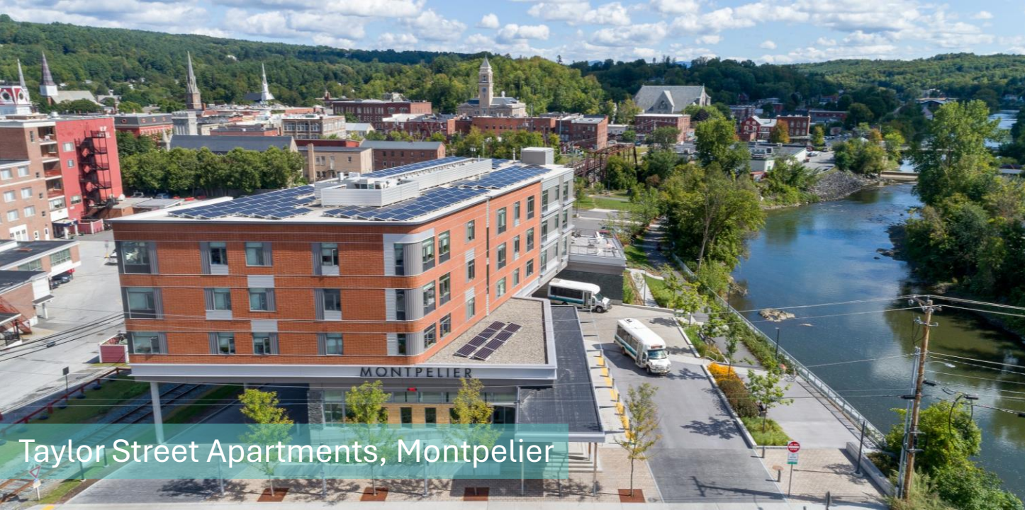
Taylor Street Apartments, Montpelier