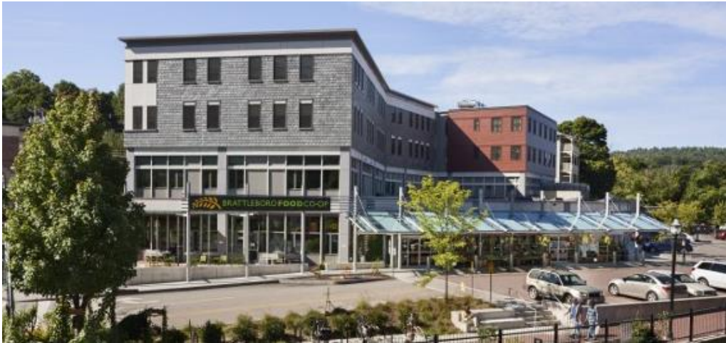
Brattleboro Food Coop, Brattleboro