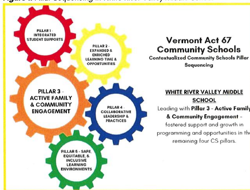
Figure 1. Pillar Sequencing in White River Valley Middle School

Lastly, the way this grant program was built and managed by the VT AOE intentionally created opportunities for connection, collaboration, and social capital development across the state. This purposeful development of a Community of Practice helped to counteract the isolation many school leaders experience, providing a collegial and supportive network where school leaders and State Education Agency, and University partners could connect and learn from one another.