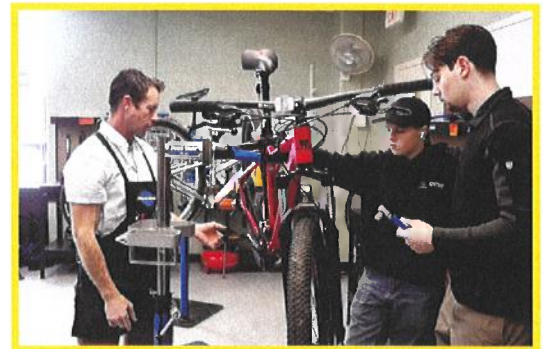
Students at Hazen Union School learning bicycle maintenance and mechanics in partnership with local business and Lamoyille Valley Rail Trail.