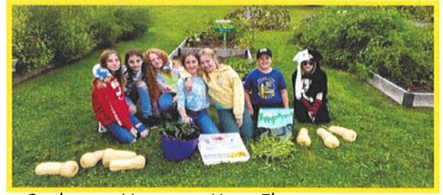
Students at Vergennes Union Elementary preparing fresh produce for weekend backpack program & community food bank donations.

VT Community Schools funding and partnerships provided services to students that may have not been eligible for federal social safety net programs, based on definitions and criteria, enhancing overall health and wellness of students, families, and communities.