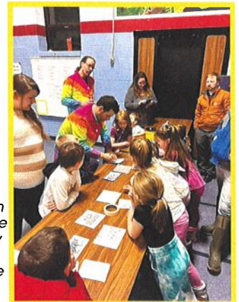
Early Childhood Education students and families in the North Country Supervisory Union participate in the NCSU 'Art Van-Go' mobile arts lab.