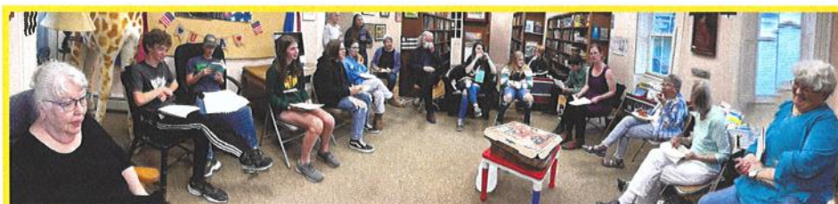
White River Valley Middle School students participate in community-wide reads with elders from the local community.