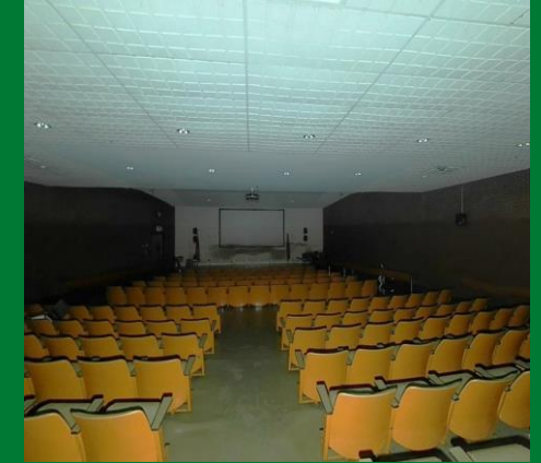
Group 3: North side of street