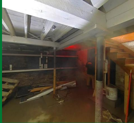
Group 1: South side of street, basement impacted