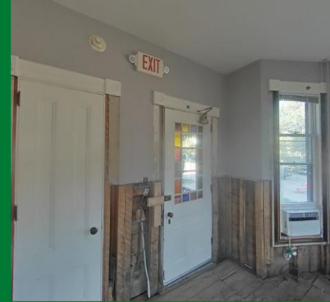
Group 2: South side of street, basement and first floor impacted