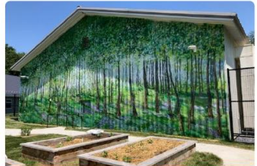
River Valley Therapeutic Residence, Essex