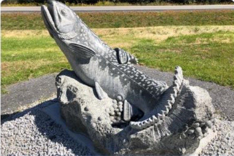
Fish Culture Station Roxbury