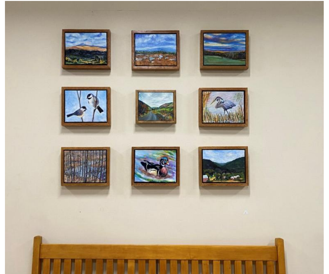
Artist: Dan Gottsegen Installed 2025