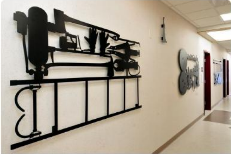
Vermont Fire Academy Pittsford