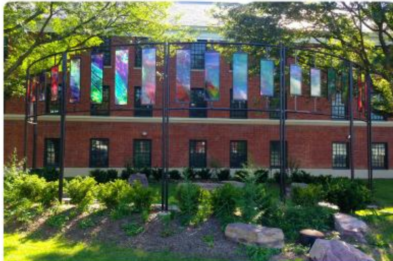
Forensics Lab & Department of Public Safety, Waterbury