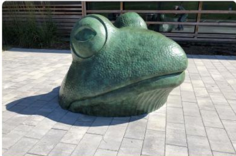
Agricultural & Environmental Lab, Randolph Center