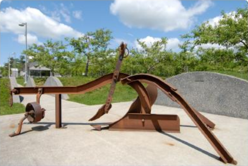
Northbound I89 Rest Area Williston