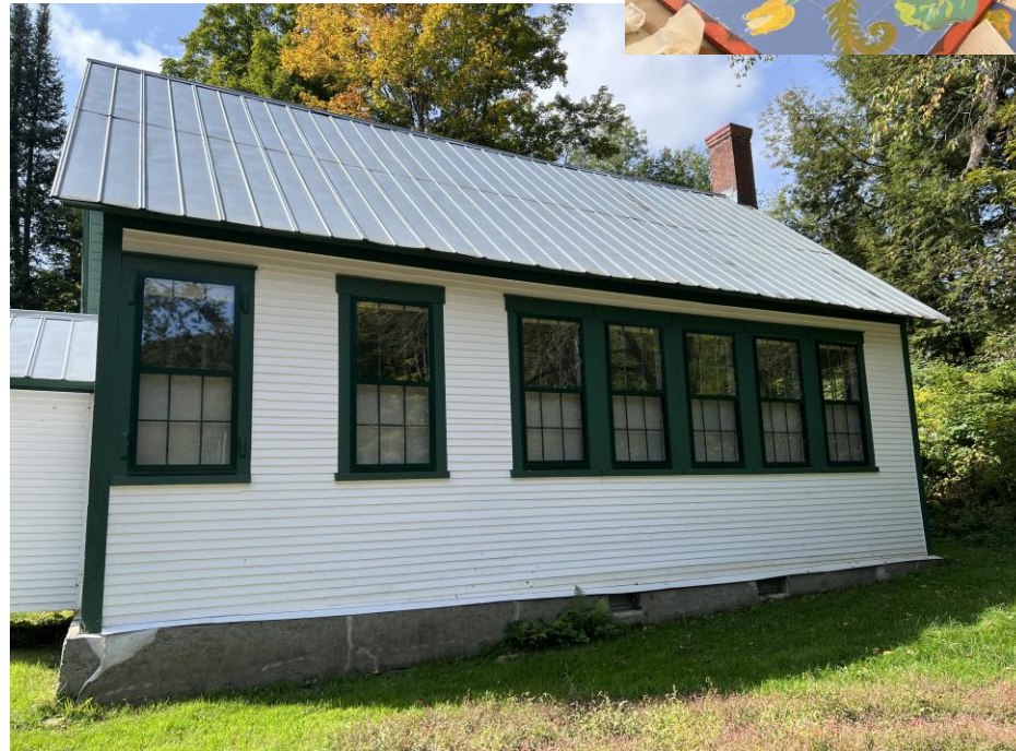
Corner School Resource Center, Granville

"It would have been miserable to conduct our children's camp or the memoir writing seminar in the 90 plus degree temperatures of summer 2024 . Very young people and elders tend to be most affected by severe heat. Instead, everyone looked forward to being in the building. The storm windows made our air conditioning efficient; the sealed-up building stayed cool even when the air conditioning was off. "