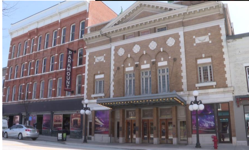
Paramount Center, Rutland

"Previously we relied on our crew to design and hang each show exclusive of one another - due to the limited overhead space. Now technicians can make the best use of our 4-hour work minimum as they can hang multiple shows at once - the savings in efficiencies are tangible. "