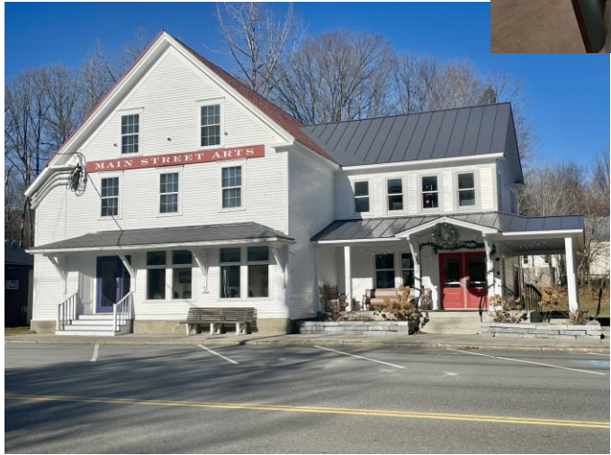
Main Street Arts, Saxtons River