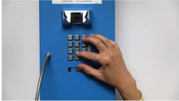
A woman in a Connecticut prison makes a phone call.