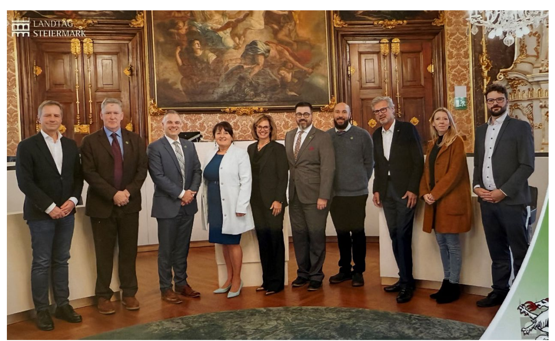
Figure 9.1: Vermont's Commissioner of Labor, Secretary of Commerce and Community Development, Director of Workforce Development, and Director of Business Recruitment and International Trade visited Austria in October 2024. In the photo above, the Vermont Delegation, along with members of the Styrian Parliament and the Styrian Economic Chamber met in the Parliamentary Chamber.