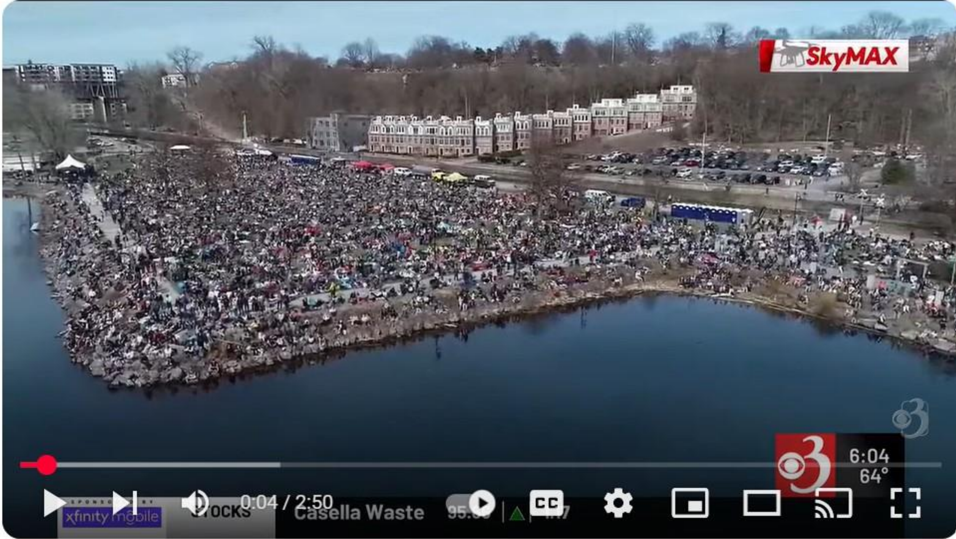
Burlington Waterfront during the Eclipse