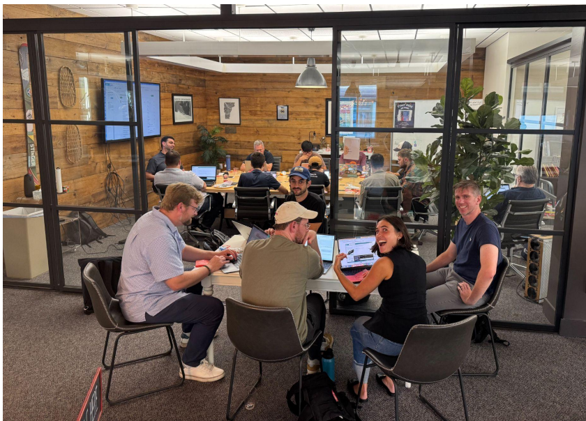
Vibe Coding Meetup 2025

Simply put, VCET offers actionable advantages to Vermont's entrepreneurs through: