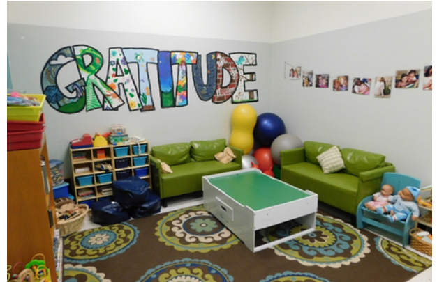
Kids-A-Part family visitation space within the correctional facility