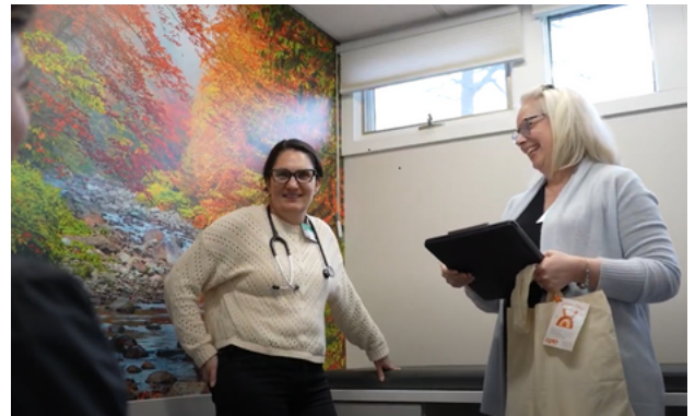
DULCE visit at the South Burlington Timber Lane Pediatrics office