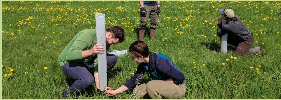
Natural Resources Conservation & Restoration