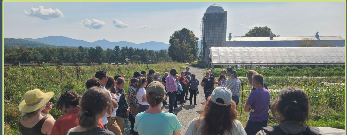
Education & Outreach