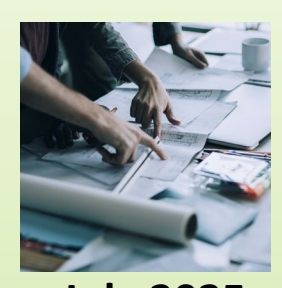
July 2025 Construction Documents