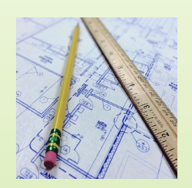
January 2025 Design Development