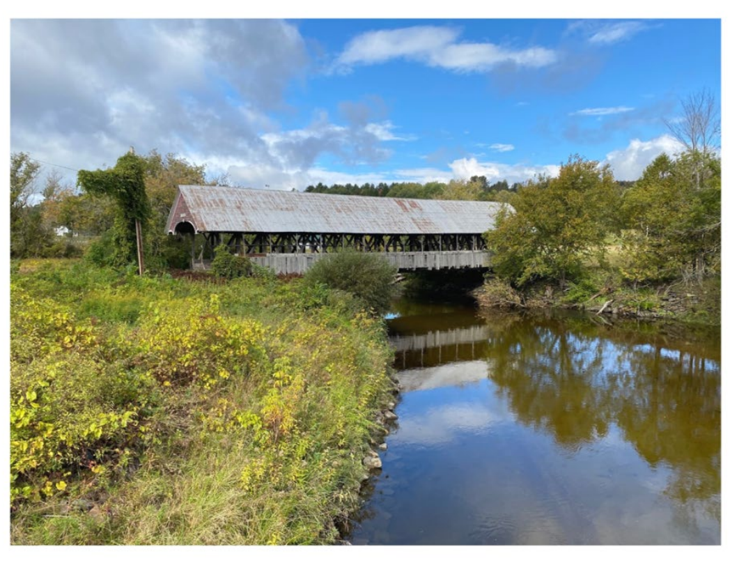
Sanborn Covered Bridge, Lyndon $20,000 Fiscal Year 2023