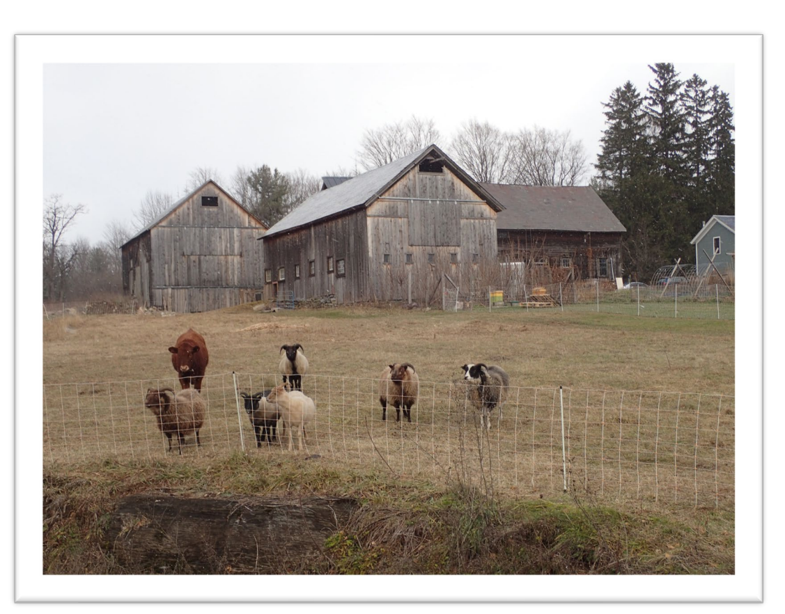
The Barnyard, Cornwall $15,000