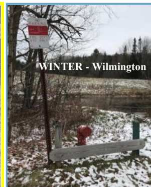
WINTER - Wilmington