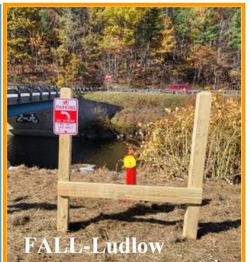
FALL - Ludlow