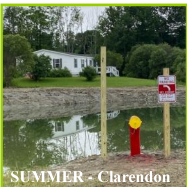
SUMMER - Clarendon

RFP systems are reliable rural water supply sources year round!