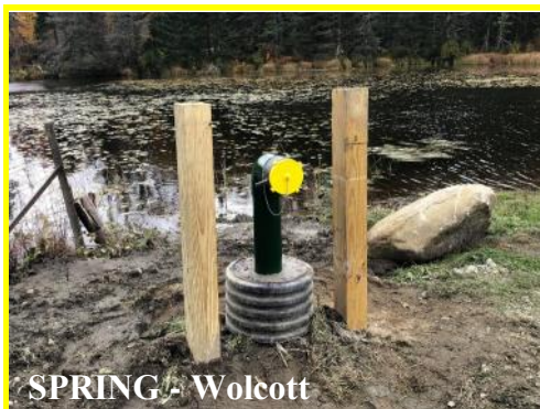
SPRING - Wolcott